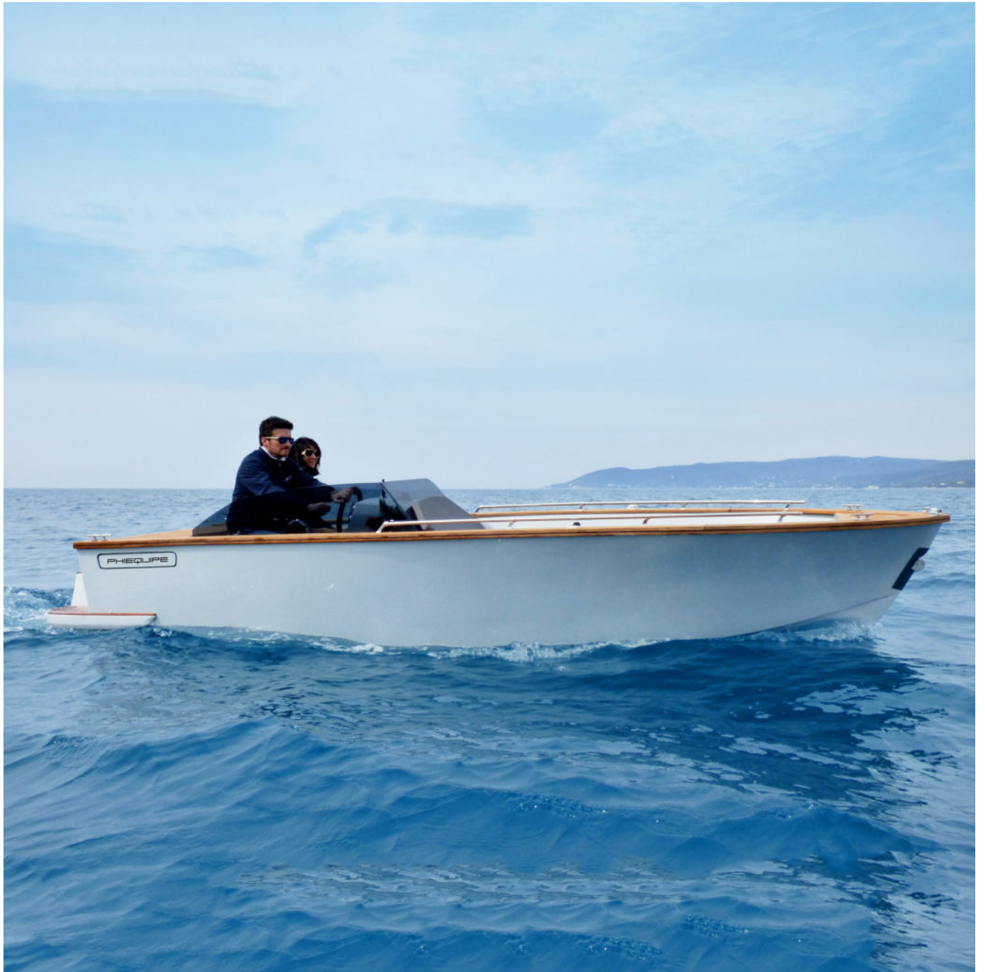
MB 18 Tender