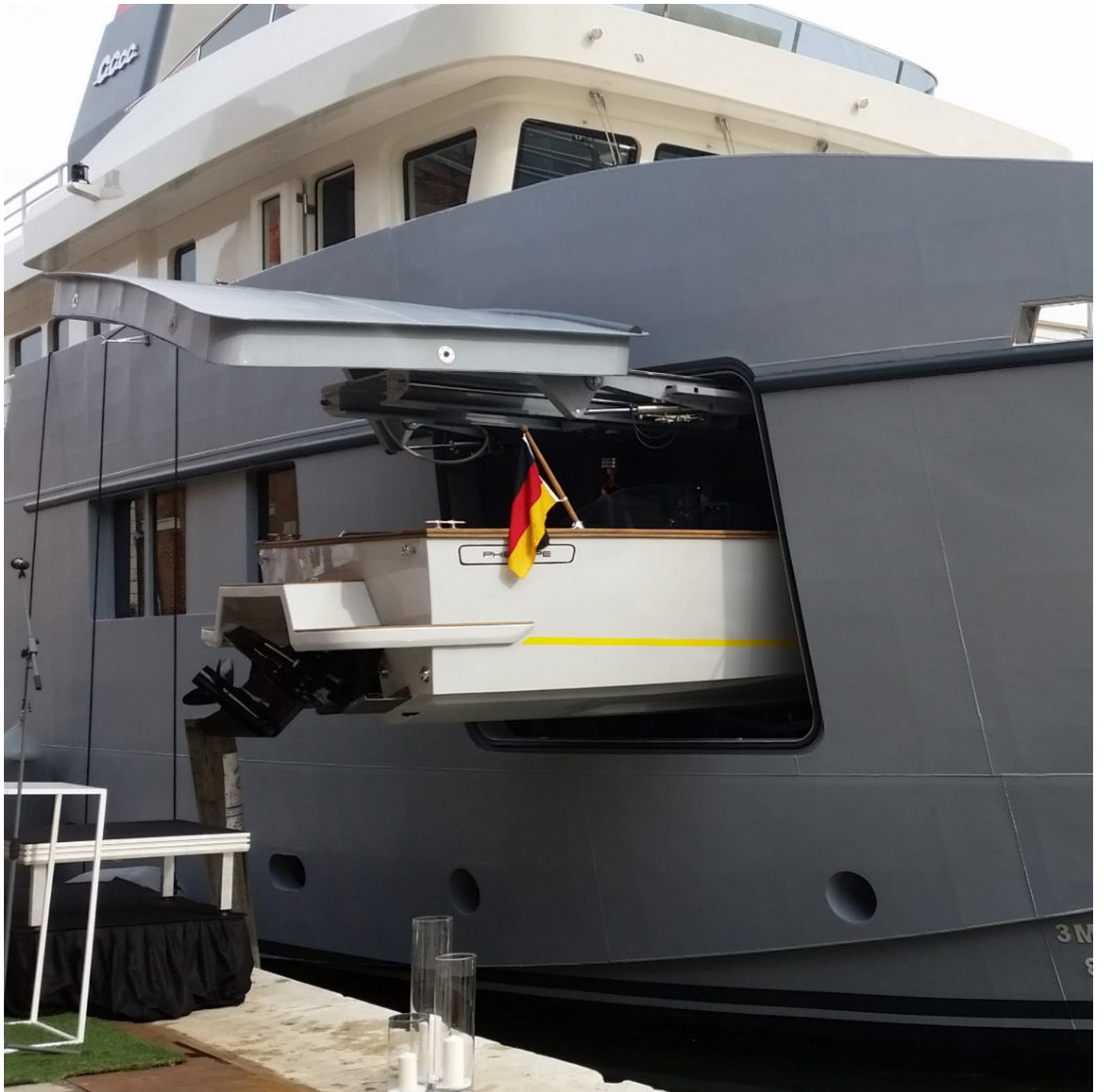
MB 18 Tender