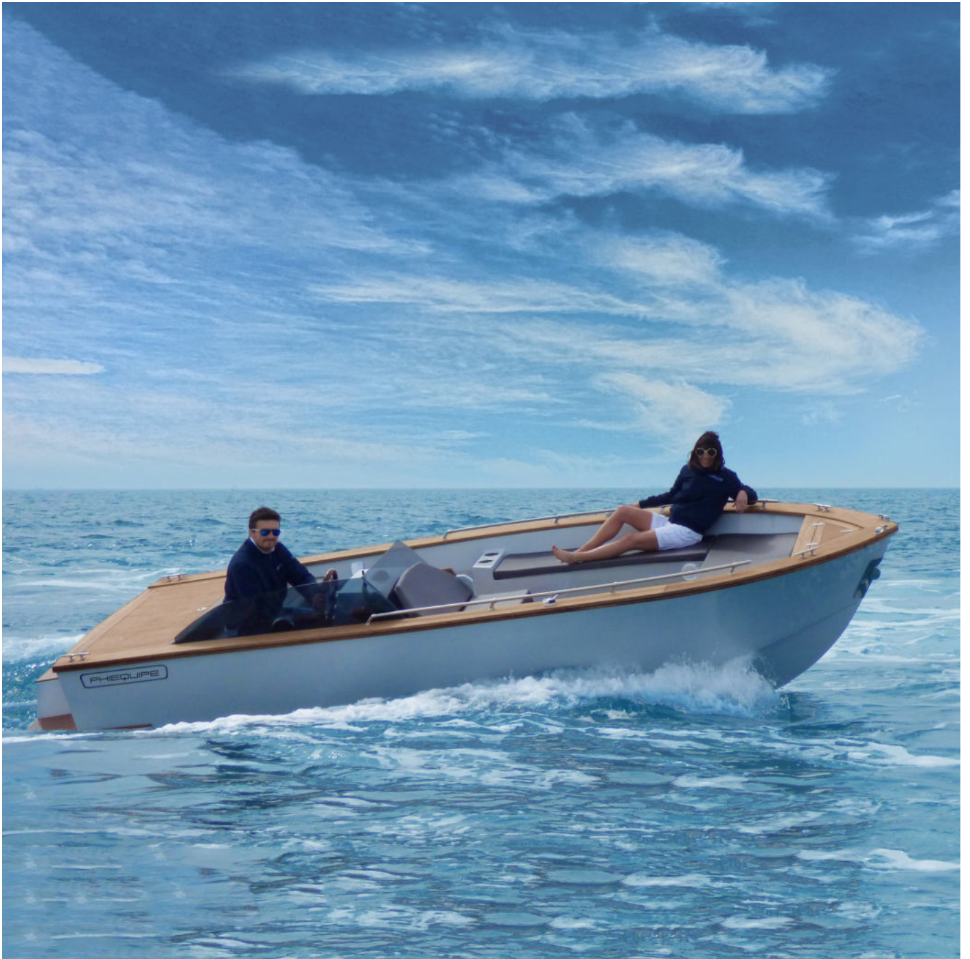
MB 18 Tender