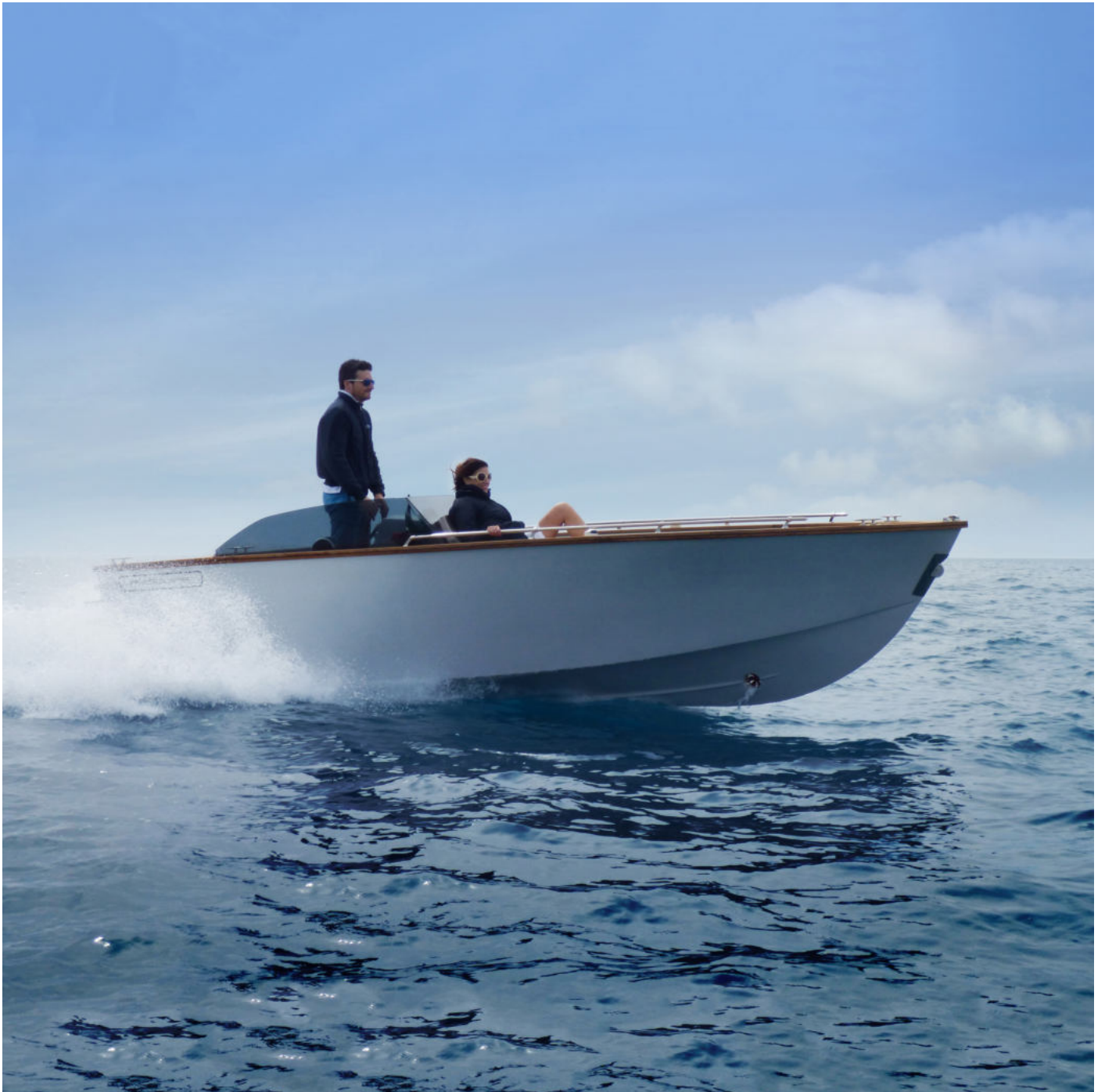
MB 18 Tender