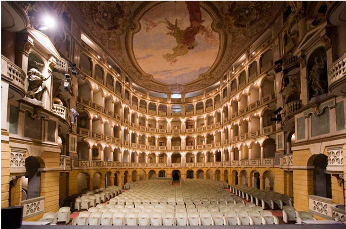
Fraschini theater in Pavia city, Lombardy, Italy

From the land of musicians truly musical equipment !