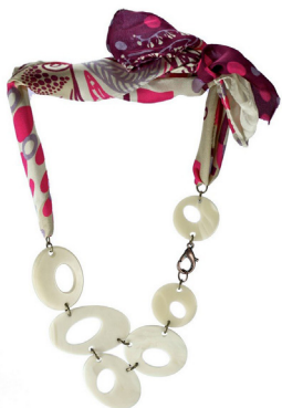
SILK SHORT NECKLACE