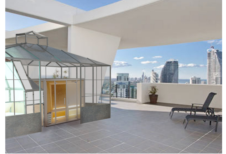
Hydrovision Penthouse Setting