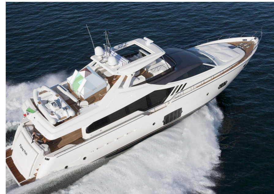
Naval fly bridge setting