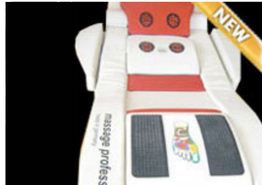
Massaging infrared beds (infrared massage system).