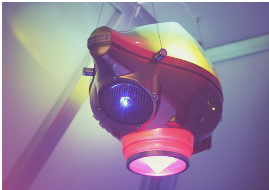
Wellness diffuser 5.0