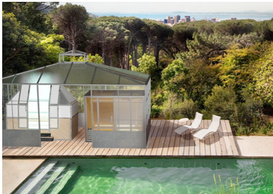
Hydrovison setting and Spa pool/Outdoor