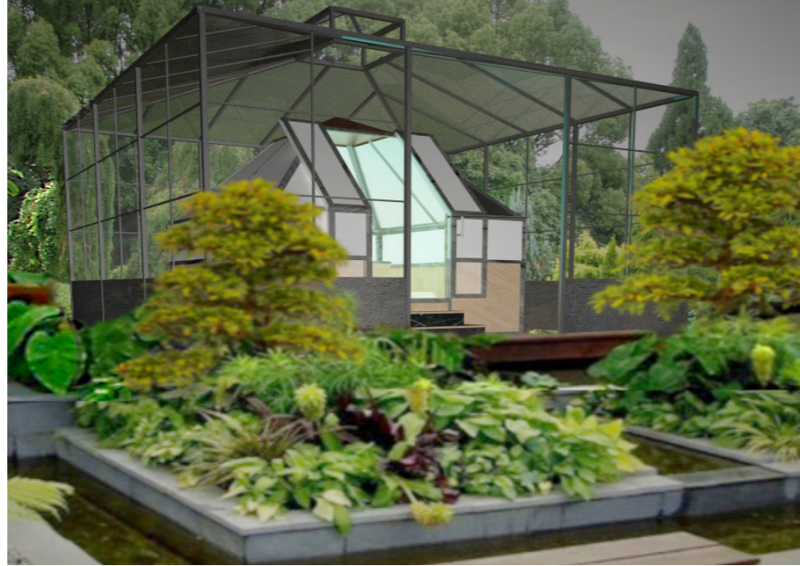
Outdoor Setting : Garden and Green