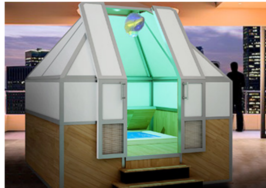
Home Spa Setting