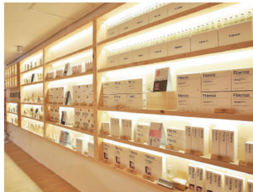
Beautiq Store, Manila

Technical data for pharmacists only. All reproduction on medias, Web included, is forbidden.