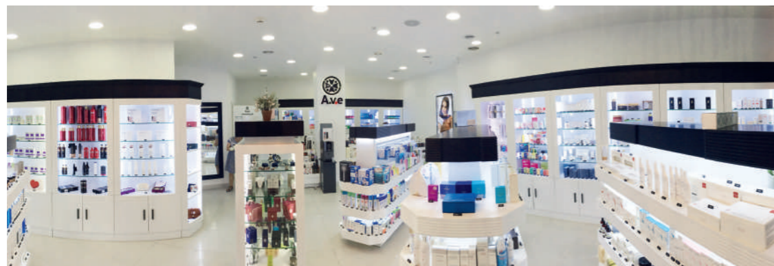
Ave Pharmacy, Moscow