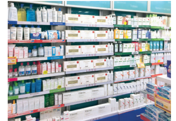
Sensiblu Pharmacy, Bucharest