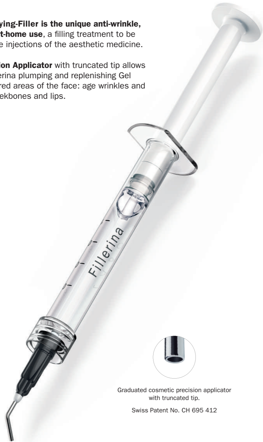
Graduated cosmetic precision applicator with truncated tip.

The Patented Precision Applicator with truncated tip allows to perfectly apply Fillerina plumping and replenishing Gel directly onto the desired areas of the face: age wrinkles and expression lines, cheekbones and lips.