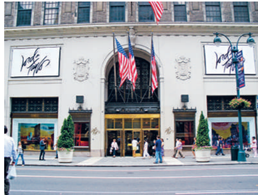
Lord & Taylor, New York