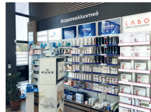
Kanaki Fotini Pharmacy, Athens