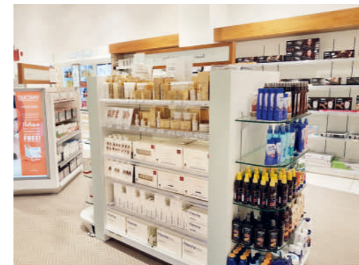
BinSina Pharmacy, Dubai

Technical data for pharmacists only. All reproduction on medias, Web included, is forbidden.