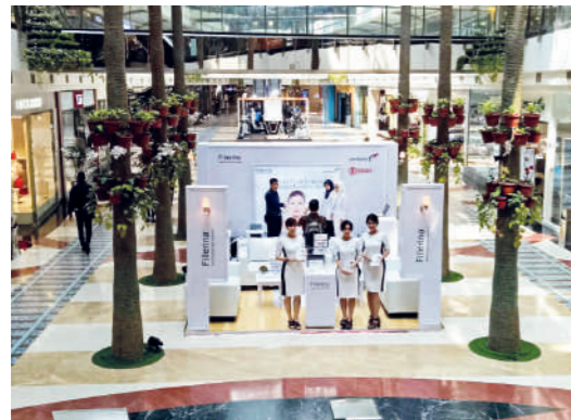
Counter at Pondok Indah Mall, Jakarta