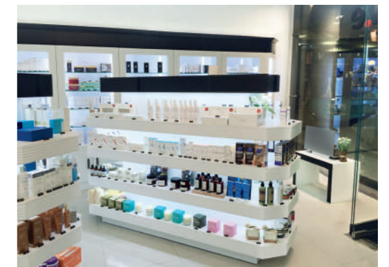
Ave Pharmacy, Moscow