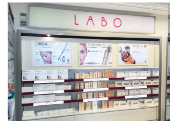
Zaytouna Pharmacy, Beirut