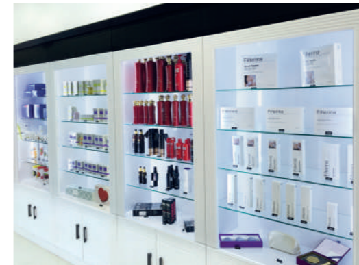
Ave Pharmacy, Moscow