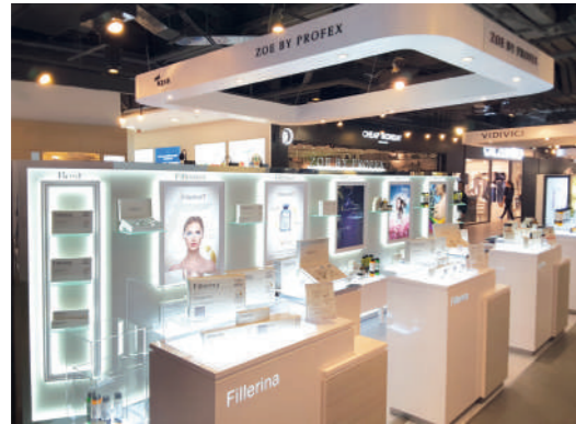
LCX, Hong Kong