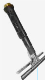
Window cleaner with diffuser 250mm - 350mm - 450mm