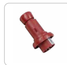
Electric plug IEC309/16A 3~ 400 V - 50/60 Hz