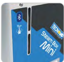
Water tank level indicator