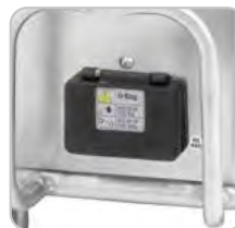
Steam outlet 6 bar / 8 bar - 7P