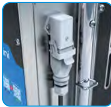
Vacuum cleaner power supply