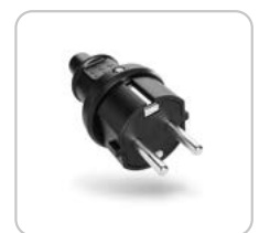
Electric plug SCHUKO 1~ 230 V - 50/60 Hz