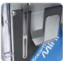
Detergent tank level indicator