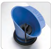
Water tank with silicone cap