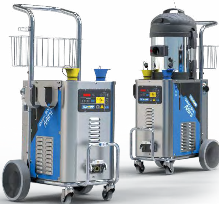
Steam Box Mini