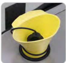
Detergent tank with silicone cap