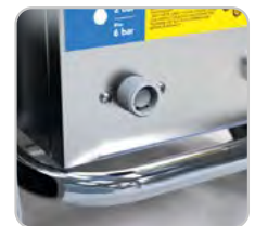
Water mains connection