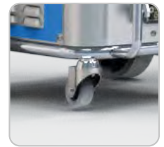
Anti-scratch rubber wheels 360°