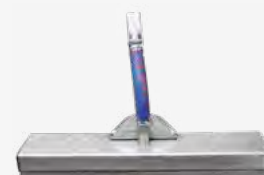
Steam brush with bristles 250mm - 350mm - 450mm