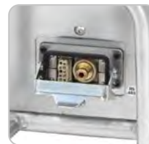
Steam outlet 10 bar - 12P