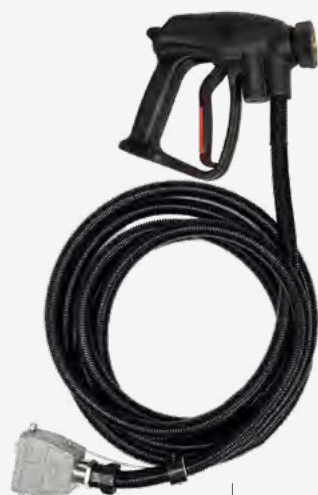
Steam hose 5m - 8m