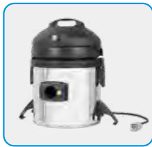
Vacuum drum 5 liters or 7,5 liters