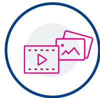
PHOTO AND VIDEO CREATION