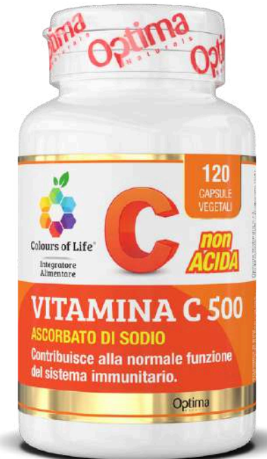
VITAMIN C 500