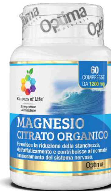
ORGANIC MAGNESIUM CITRATE