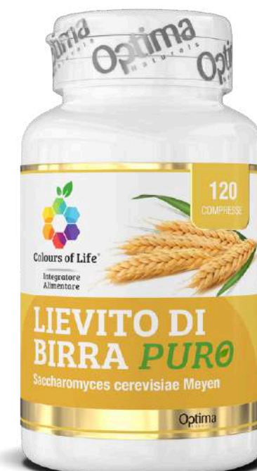
PURE BREWER'S YEAST