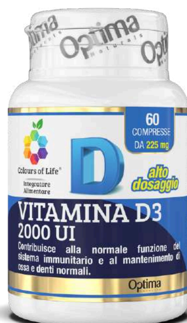
VITAMIN D3 2000 IU