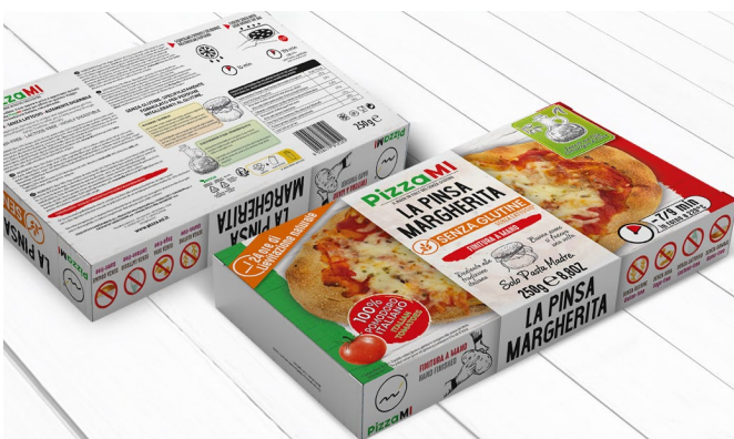
PACKAGING SAMPLE IMAGES