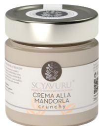
Mandorla Crunchy Crunchy Almond