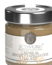
Speculoos Salato Salty Speculoos Biscuit