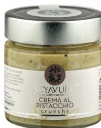
Pistachio Crunchy Crunchy Pistachio