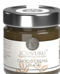
Choco Crema Salata Salty Choco Cream