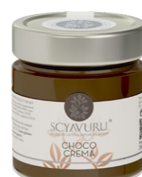
Choco Crema Choco Cream