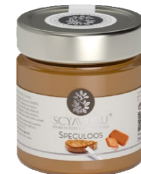
Biscotto Speculoos 100% 100% Speculoos Biscuit