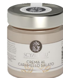
Caramello Salato Salty Caramel