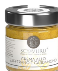
Zafferano e Cardamomo Saffron and Cardamom