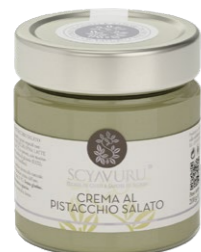
Pistachio Salato Salty Pistachio