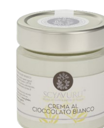
Cioccolato Bianco White Chocolate