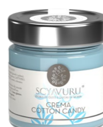
Cotton Candy Cotton Candy