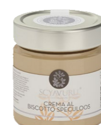
Biscotto Speculoos Speculoos Biscuit