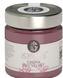
Red Velvet Red Velvet