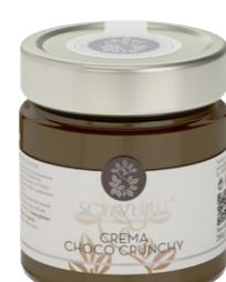
Choco Crunchy Choco Crunchy