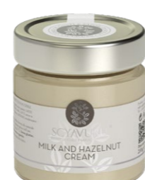
Latte e Nocciole Milk and Hazelnuts