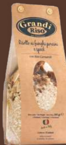
RICE WITH SPECK AND PORCINI MUSHROOMS