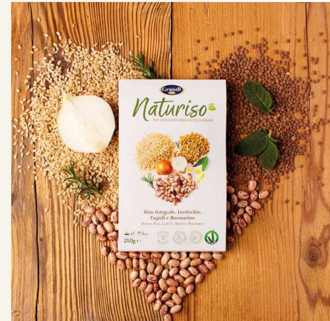
Brown Rice, Lentils, Beans e Rosemary