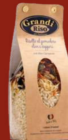
RICE WITH TOMATOES, OLIVES AND CAPERS