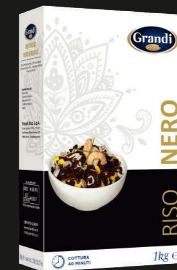
GRANDI PER PICCOLI

Easy to digest, rich in fibres and nutrients. From Venere to Basmati, to the selection for children the perfect rice for every taste and dietary need.