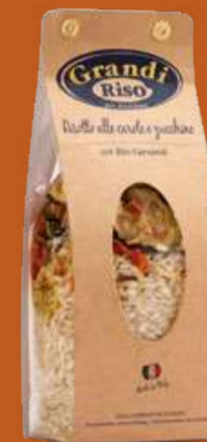
RICE WITH ZUCCHINI AND CARROTS