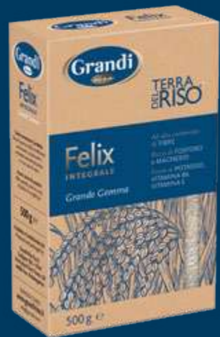
FELIX BROWN RICE