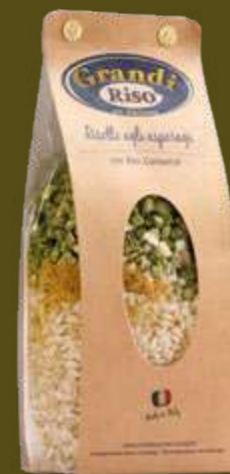
RICE WITH ASPARAGOUS

The excellence of Carnaroli rice and the best ingredients selected by hand. All you need for a higher quality rice.