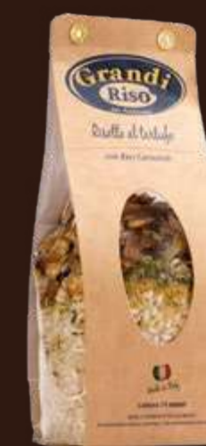
RICE WITH TARTUFO