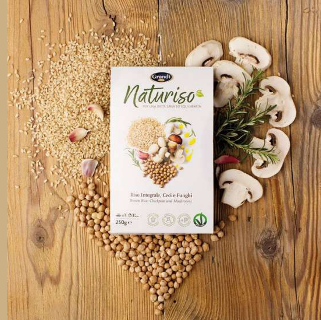
Brown Rice, Chickpeas and Mushrooms

The best selection of whole grain rice and the nutritionally perfect recipes studied by the University of Parma for a healthy, tasty, genuine product ready in few minutes.