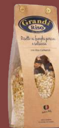
RICE WITH PORCINI MUSHROOMS AND SAUSAGE