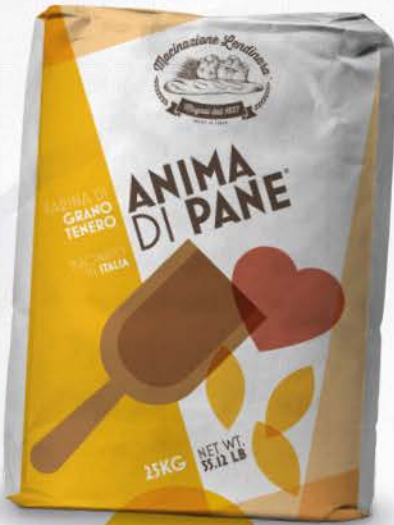
TYPE "0" AND "00" > 400