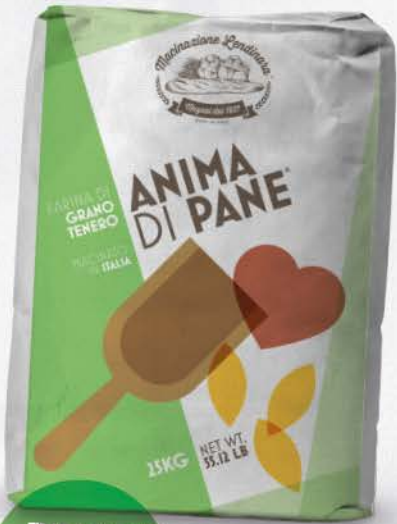
TYPE "0" AND "00" W 200-240