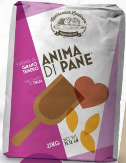
TYPE "0" AND "00" W 300