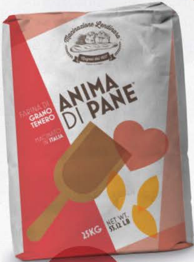
TYPE "0" AND "00" W 340-360