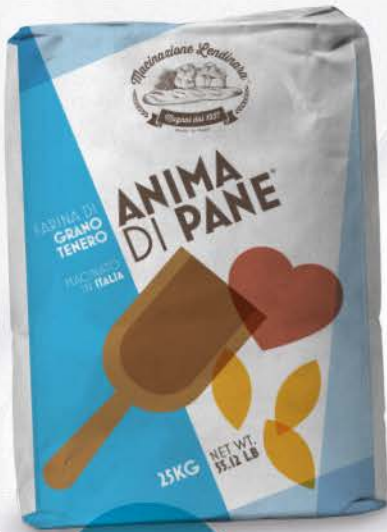
TYPE "0" AND "00" W 250-260