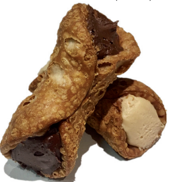
Cannolo Snack® (Tastes "chocolate" e "hazelnut")