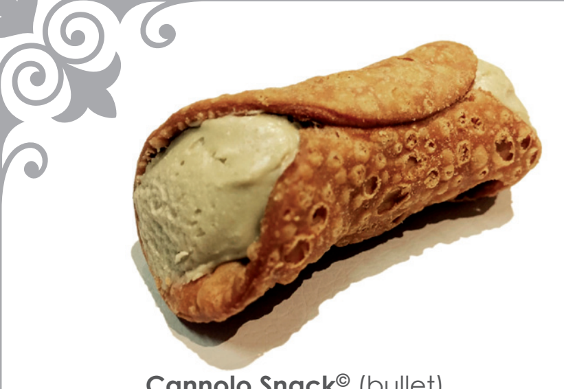
Cannolo Snack® (bullet)