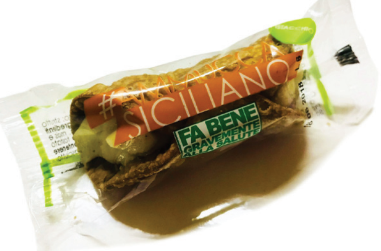
Cannolo Snack® (packaged)