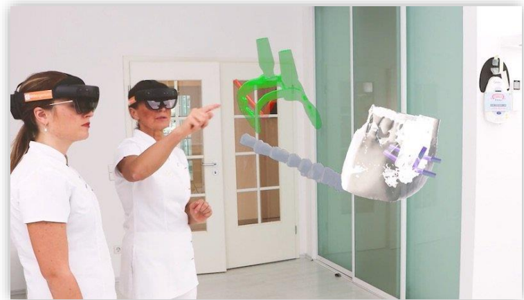
Local team discussion

HoloDentist and ObiScanner are fully integrated and compatible, allowing doctors to send all the patients' 3D data (intra-oral scans, CBCTs, face scans, digital wax ups, etc) to the headset with just one click. Supported file types are .obj, .ply and .stl.