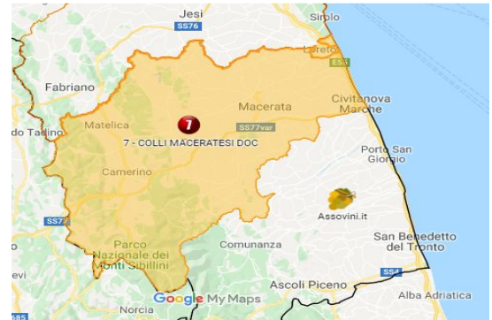
Colli Maceratesi Doc

The red wine is made from grapes Montepulciano (85%) and Sangiovese (15%).