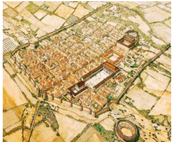
URBS SALVIA archaeological park