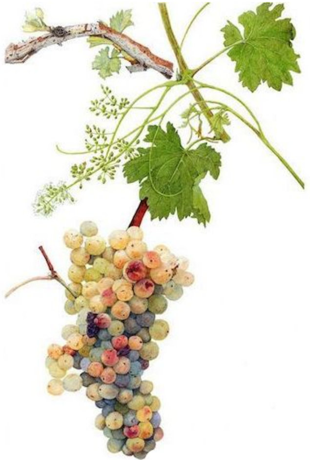
Cultivar Vitis Vinifera

This grape, also known with several other synonyms, makes probably part of the ancient Greek group of grapes (the “Greeks”), imported in Italy by the first settlers in Magna Grecia.