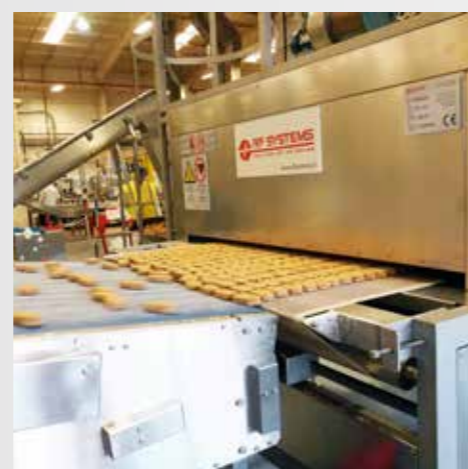
> Drying of cookies 1350 Kg/h throughput