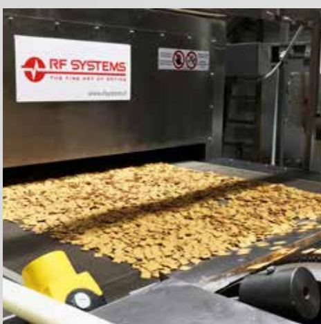
> Drying of crackers 600 Kg/h throughput