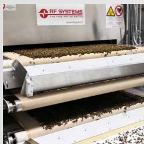
> Drying of candied fruit citrus 1000 Kg/h throughput