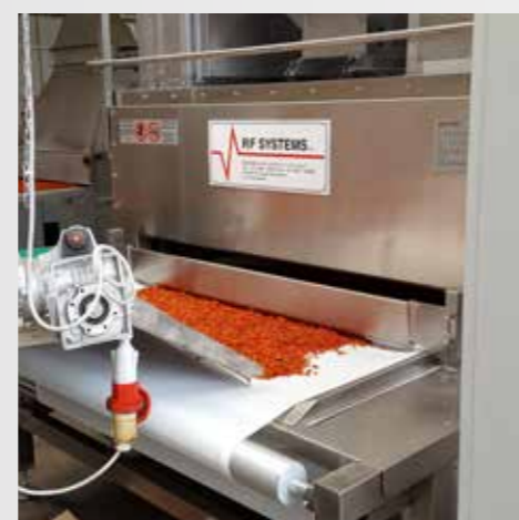
➤ Sanitization of corn 1000 Kg/h throughput