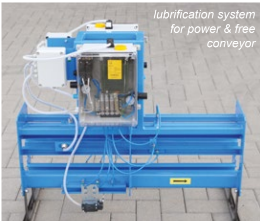
lubrication system for power & free conveyor