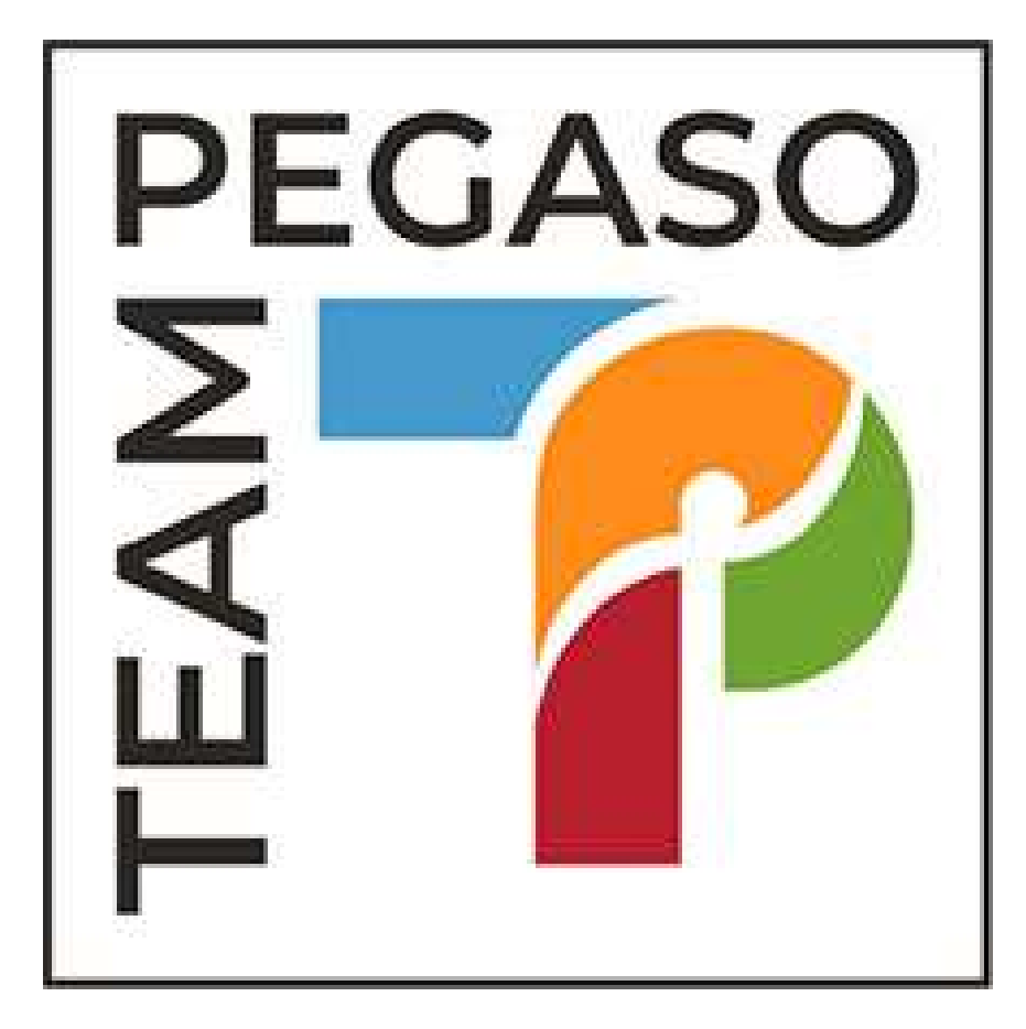
Your multi know-how expert team