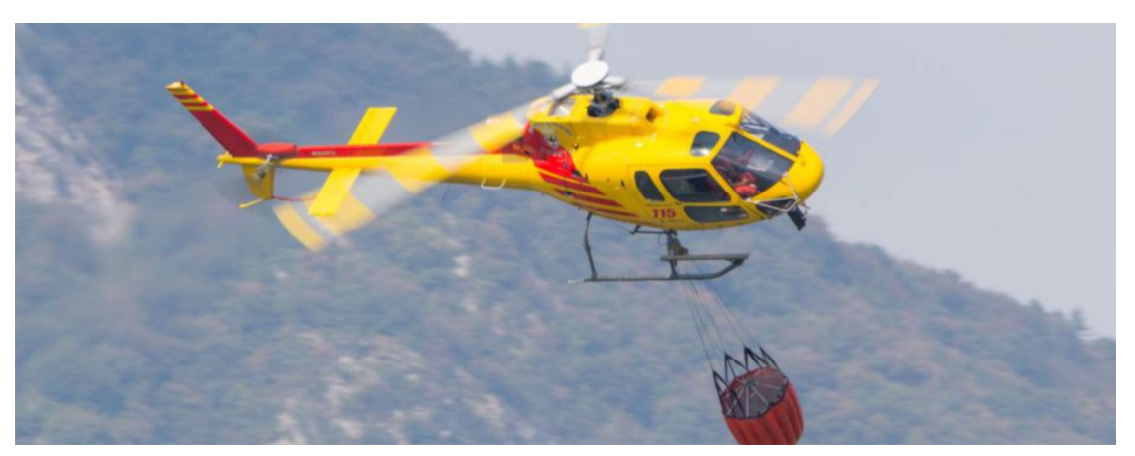
ED. DECEMBER 2022