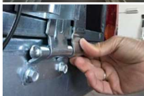
ED. DECEMBER 2022