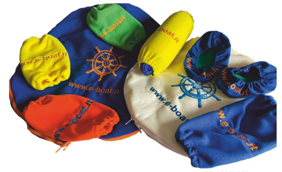
ED. DECEMBER 2022