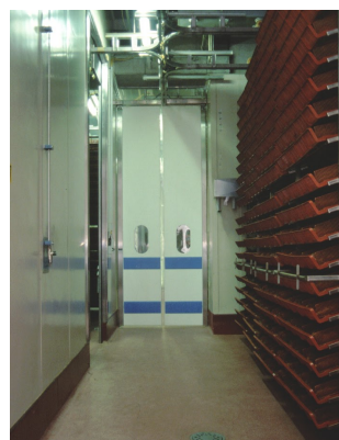
Version G for large stockrooms with overhead crane tracks.