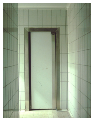
Version FDA for technical areas

Upon request, Windor FDA is available with specific features such as: