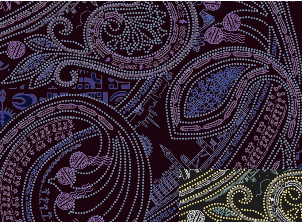
KI-PON PRIME Style: Orient Express Col: Blackberry

The design is available in three color variations.