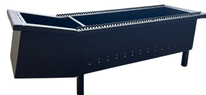
grill for skewer