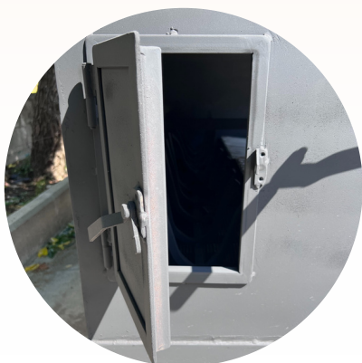
door load wood