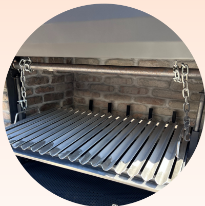
adjustment with pulley