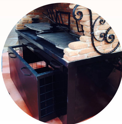
cart for wood