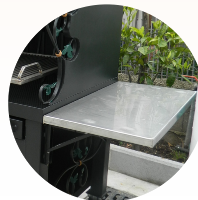
steel side sill