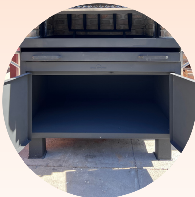
compartment with door