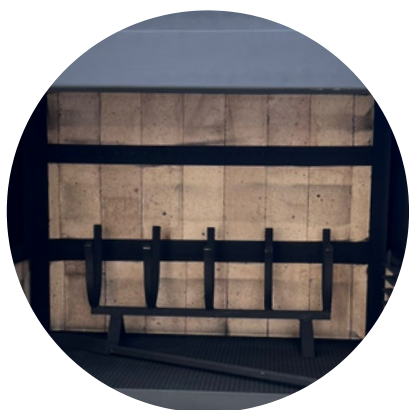
Inner lining in bricks