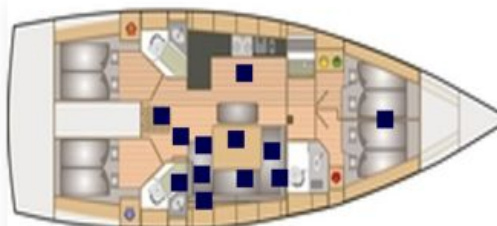
COMPLETE THE CHECKLIST