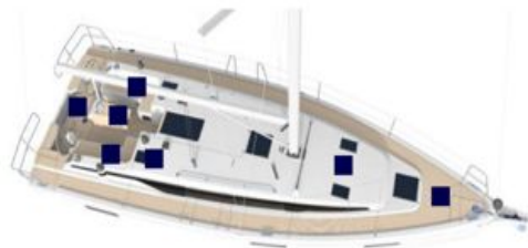
IMAGE BELOW DECK