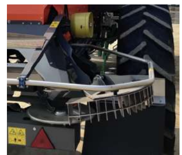
Mobile focuser for edge spreading