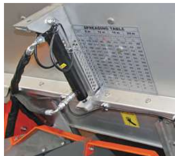
Double acting hydraulic control of fertilizer flo