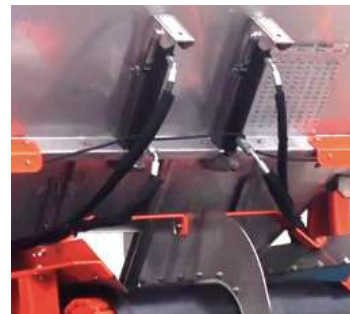
Double hydraulic flow regulator