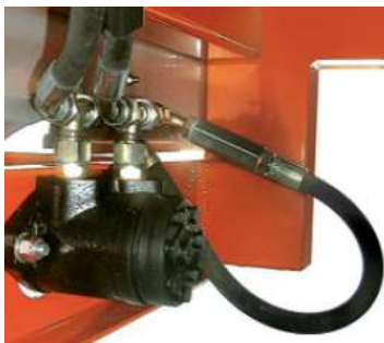
Hydraulic disc drive