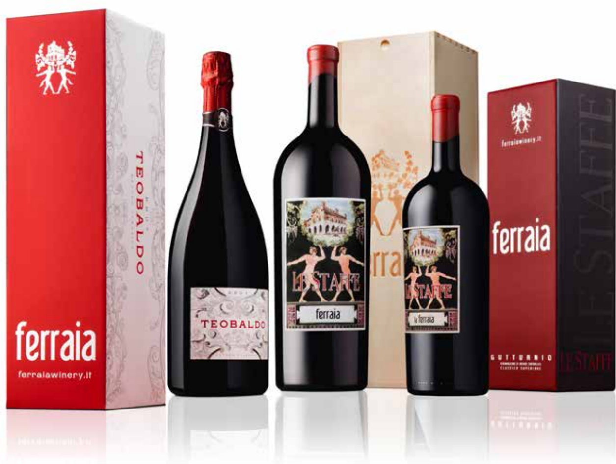
TEOBALDO Spumante Metodo Classico Brut MAGNUM (1,5 litri)