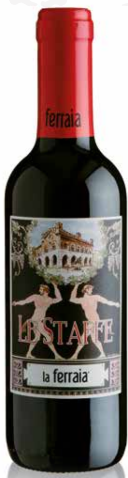
Le Staffe Gutturnio Classico Superiore Gutturnio D.O.C. (37,5 cl)