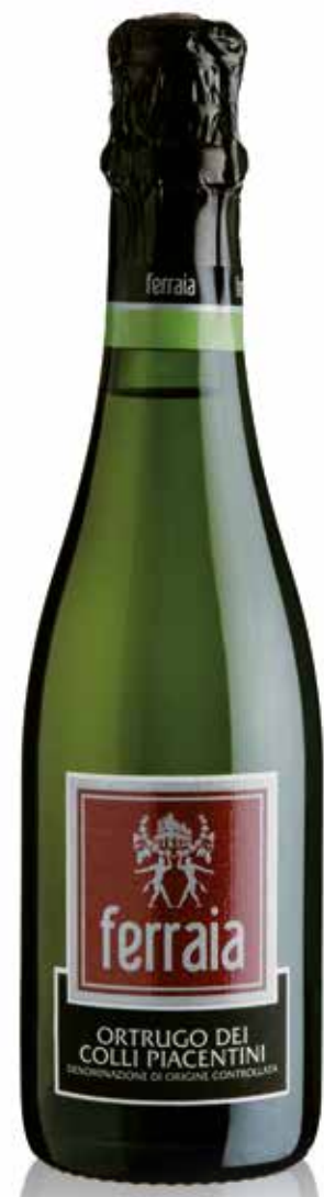
Ortrugo Vivace Colli Piacentini D.O.C. (37,5 cl)