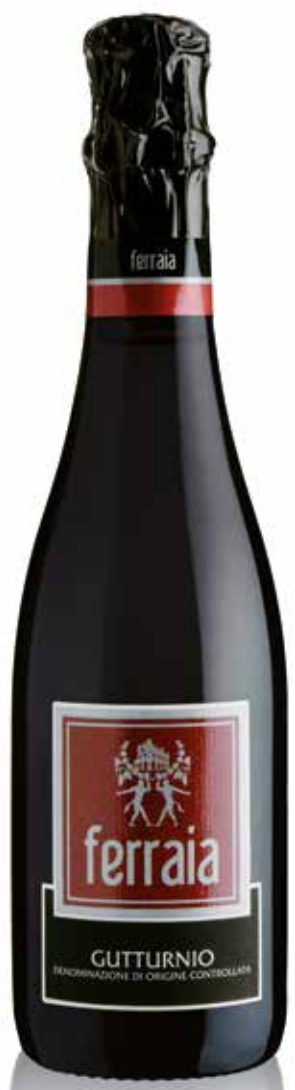
Gutturnio Vivace Gutturnio D.O.C. (37,5 cl)