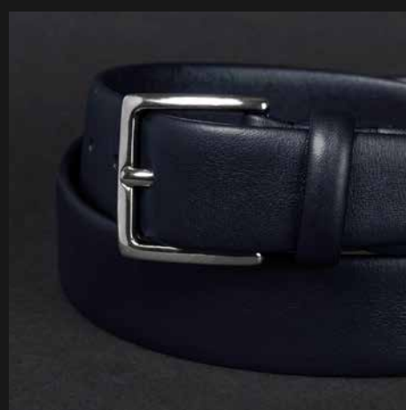
SMART N. 6 BLUE