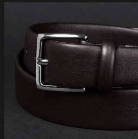
SMART N. 2 DARK BROWN