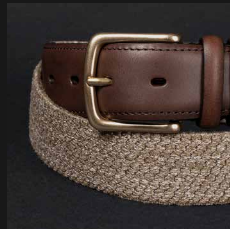
SIMPLE 475 BEIGE