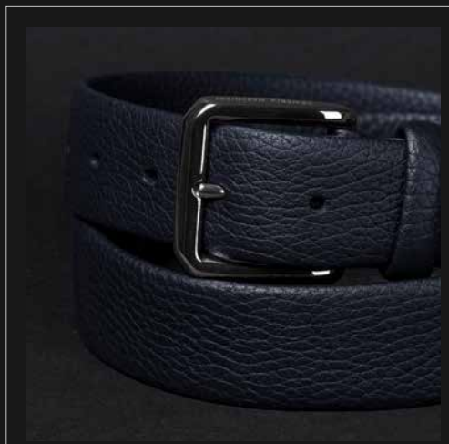
ESSENTIAL N. 4 DARK BLUE