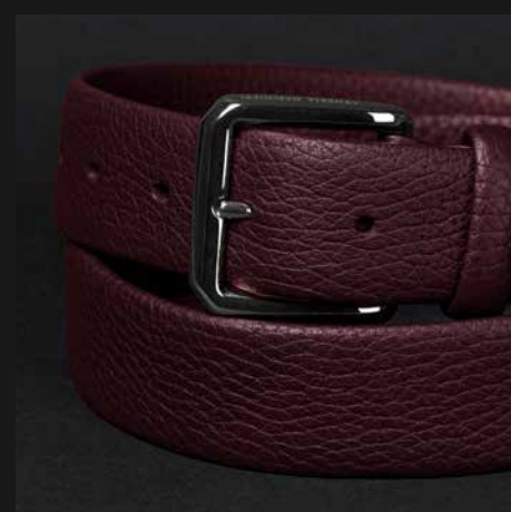
ESSENTIAL N. 3 BURGUNDY