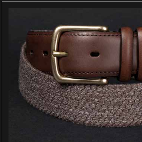
SIMPLE 458 BROWN