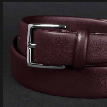
SMART N. 5 BURGUNDY