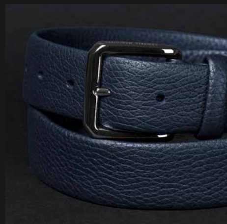
ESSENTIAL N. 5 LIGHT BLUE