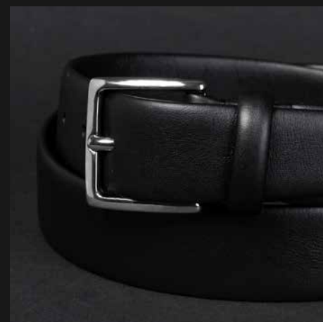
SMART N. 1 BLACK