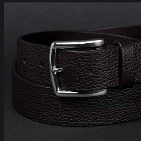
YOUNG N. 2 DARK BROWN