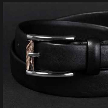
UNIQUE N. 1 BLACK