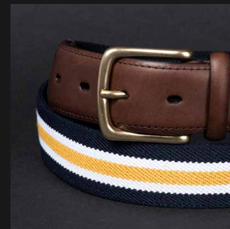
SUMMER 300 BLUE YELLOW WHITE