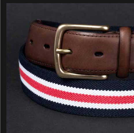
SUMMER 302 BLUE RED WHITE