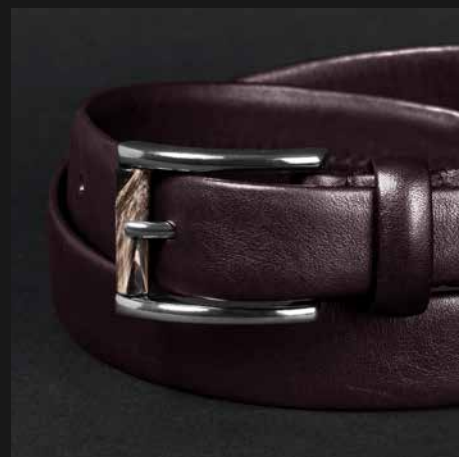
UNIQUE N. 5 BURGUNDY