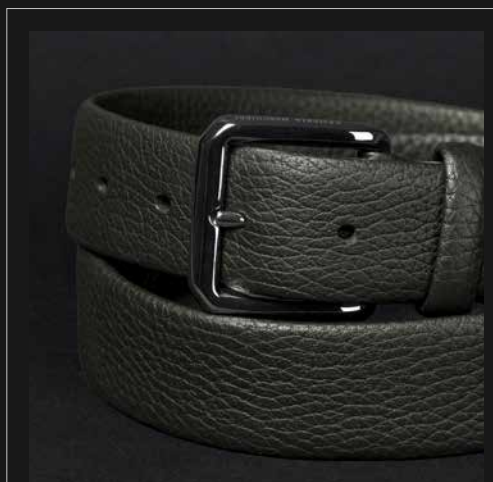
ESSENTIAL N. 6 GREEN