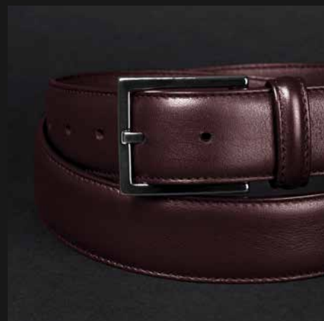
CLASSIC N. 5 BURGUNDY