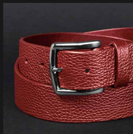
YOUNG N. 10 RED