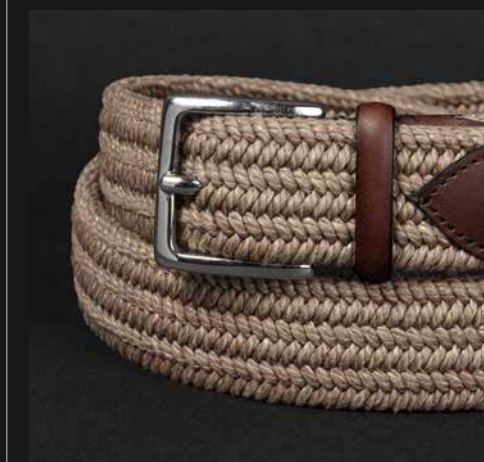
COTTON STRETCH ROPE