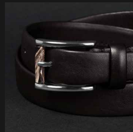
UNIQUE N. 2 DARK BROWN