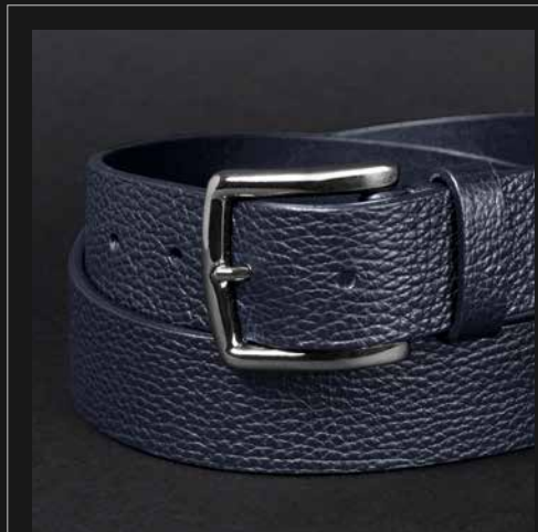
YOUNG N. 5 BLUE