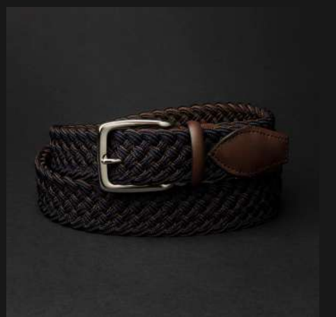
ALWAYS N.2 DARK BROWN WITH TUMBLED LEATHER