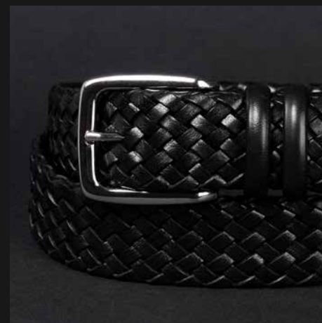
BUFALO N. 1 BLACK