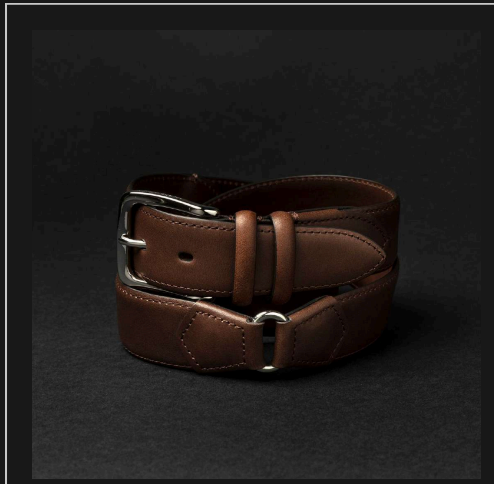
HORSE LEATHER N.1 BROWN