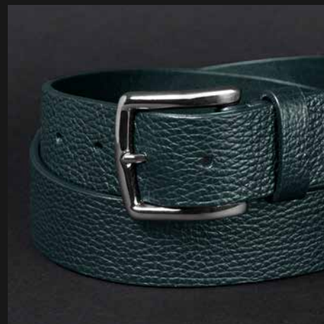
YOUNG N. 6 GREEN