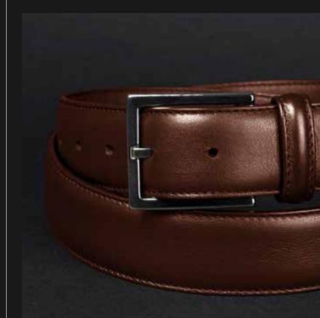
CLASSIC N. 3 MEDIUM BROWN