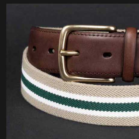
SUMMER 304 BEIGE GREEN WHITE