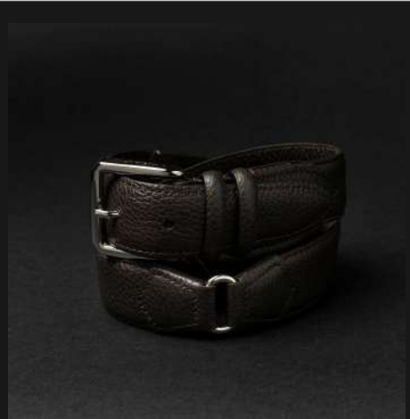
HORSE LEATHER N.2 DARK BROWN WITH TUMBLED LEATHER