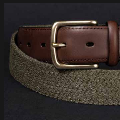
SIMPLE 501 GREEN