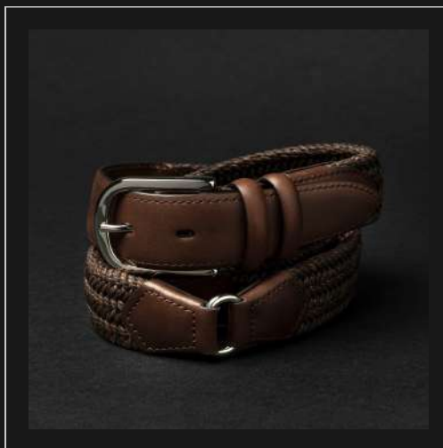
HORSE COTTON N.1 BROWN