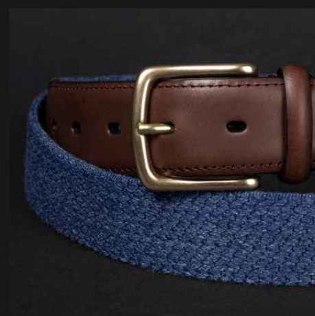
SIMPLE 457 LIGHT BLUE