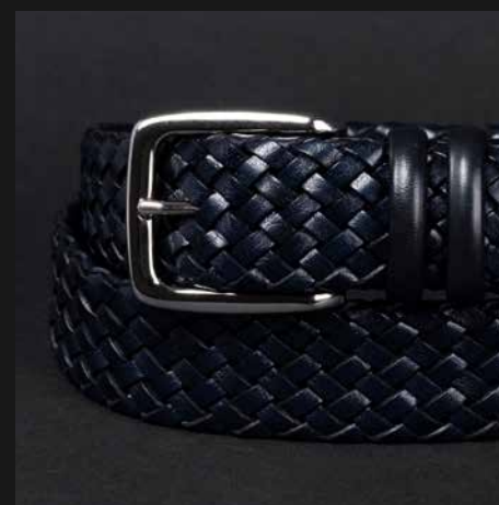
BUFALO N. 4 DARK BLUE