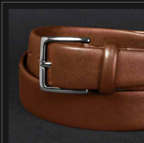
SMART N. 4 LIGHT BROWN