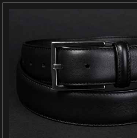
CLASSIC N. 1 BLACK