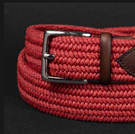
COTTON STRETCH RED