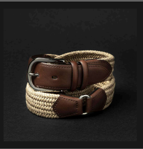
HORSE COTTON N.2 BEIGE