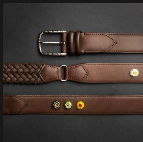
VENICE N.2 BROWN