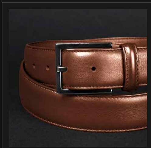
CLASSIC N. 4 LIGHT BROWN