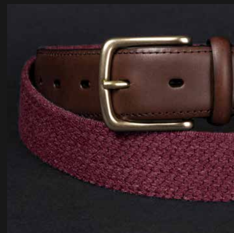
SIMPLE 500 BURGUNDY