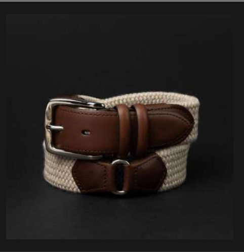
HORSE WOOL N.2 BEIGE