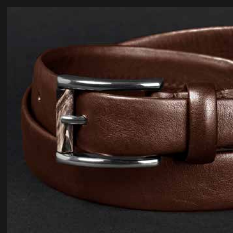
UNIQUE N. 3 MEDIUM BROWN