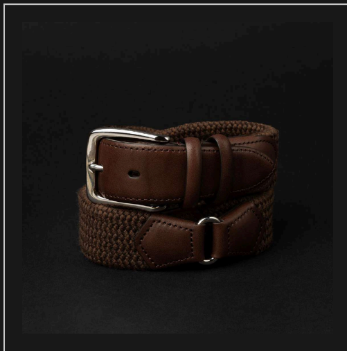
HORSE WOOL N.1 BROWN