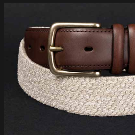
SIMPLE 145 LIGHT BEIGE