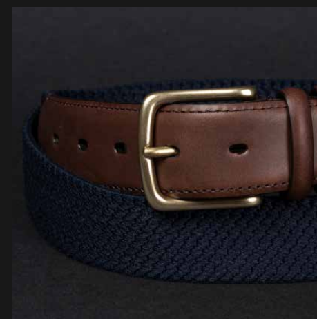
SIMPLE 206 BLUE