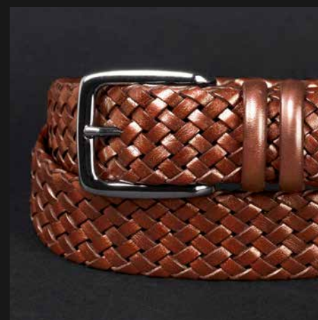
BUFALO N. 3 MEDIUM BROWN