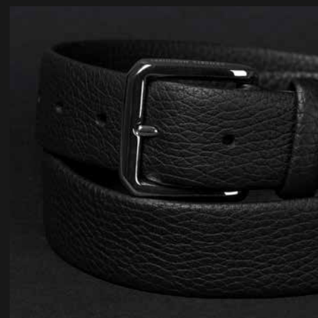
ESSENTIAL N. 1 BLACK