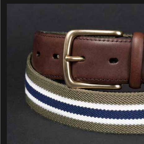
SUMMER 305 GREEN BLUE WHITE