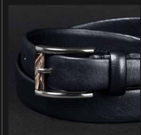
UNIQUE N. 6 BLUE