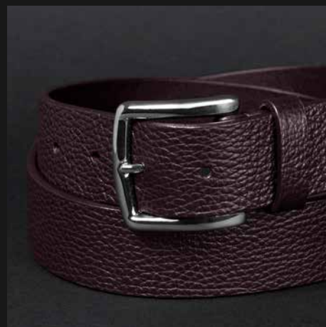
YOUNG N. 9 BURGUNDY