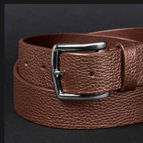
YOUNG N. 3 MEDIUM BROWN