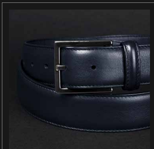
CLASSIC N. 6 BLUE