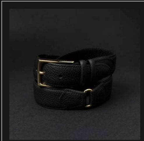
HORSE LEATHER N.3 BLACK WITH TUMBLED LEATHER