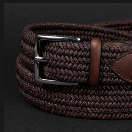
COTTON STRETCH WENGE