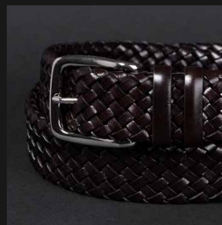
BUFALO N. 2 DARK BROWN