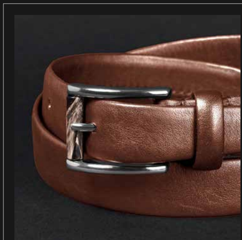
UNIQUE N. 4 LIGHT BROWN