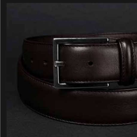
CLASSIC N. 2 DARK BROWN