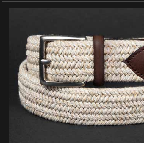
COTTON STRETCH NATURAL