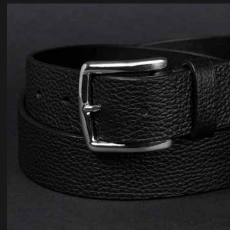
YOUNG N. 1 BLACK