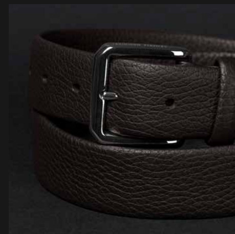
ESSENTIAL N. 2 DARK BROWN