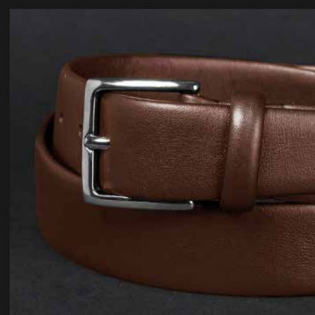
SMART N. 3 MEDIUM BROWN