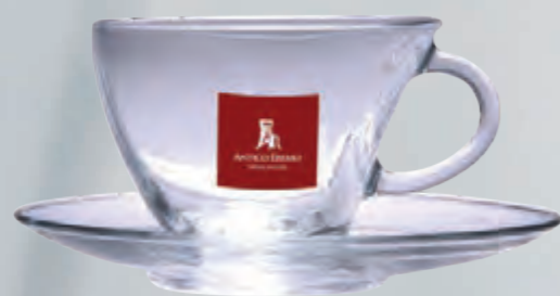
cappuccino cup with saucer mod. Penguén cod. 09993