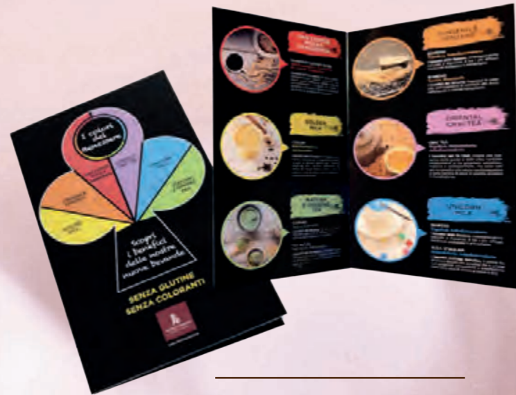
menu cod. 09971ANT