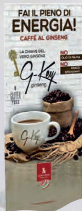
two-sided totem cod.90178