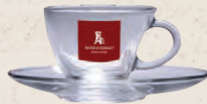
coffee cup with saucer mod. Penguen cod. 09982