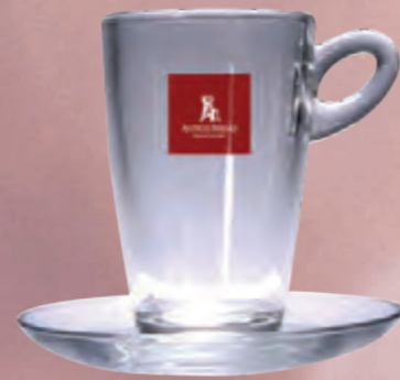
mug with saucer cod. 09998