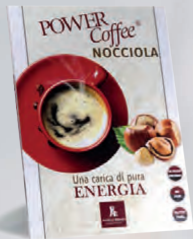
display cod. 90082