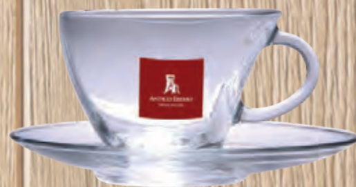
cappuccino cup with saucer mod. Penguen cod. 09993