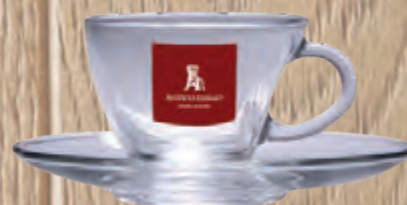
coffee cup with saucer mod. Penguen cod. 09982