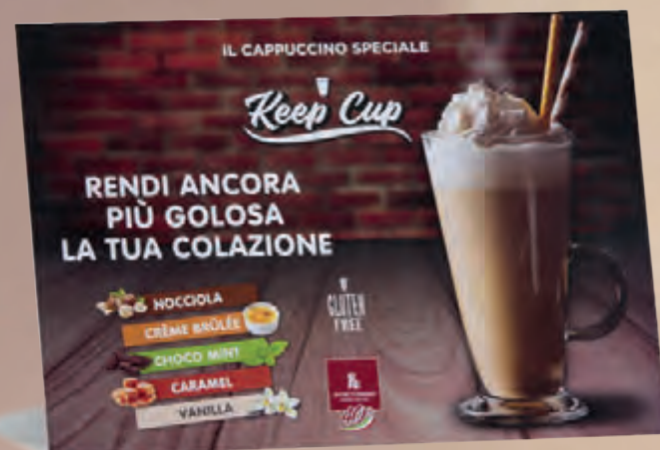
display cod. 90105