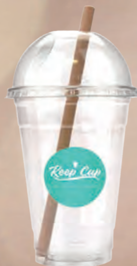
take-away cup 400 cc • cod. 099991