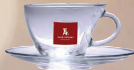
cappuccino cup with saucer mod. Penguen cod. 09993