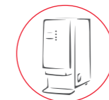
hot beverage dispenser