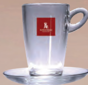
mug with saucer cod. 09998