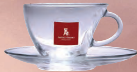
cappuccino cup with saucer mod. Penguen cod. 09993