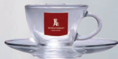
coffee cup with saucer mod. Penguén cod. 09982