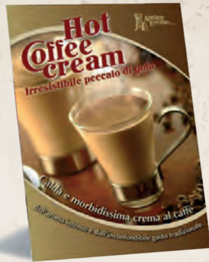
display cod. 90105