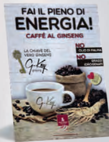
display cod. 90168