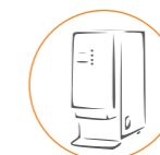
hot beverage dispenser