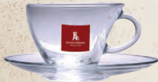
cappuccino cup with saucer mod. Penguen cod. 09993