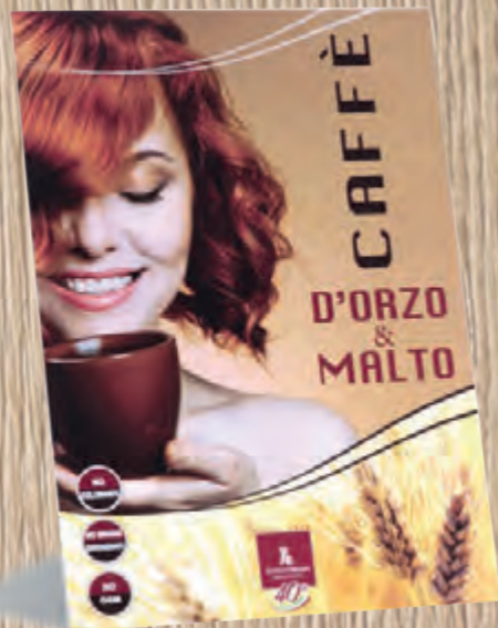
display cod. 90167