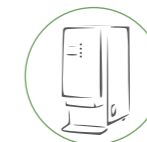
hot beverage dispenser