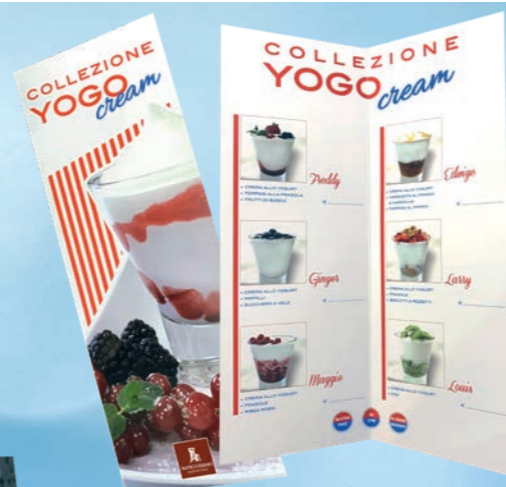
table menu 10,5x30 • cod. 09975 ANT