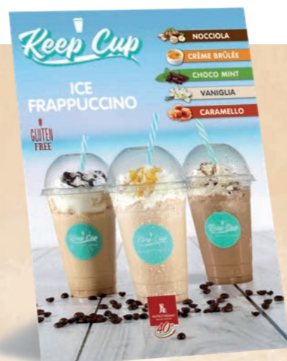
display 21x30 cm - cod. 90172