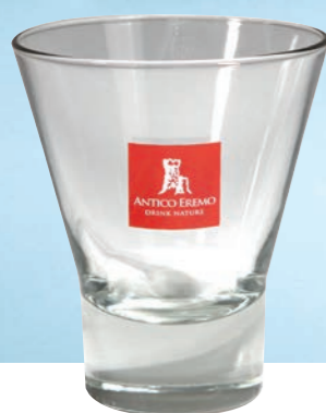
glass 25 cl. • cod. 09984