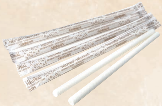
sugar straws cod. 90190