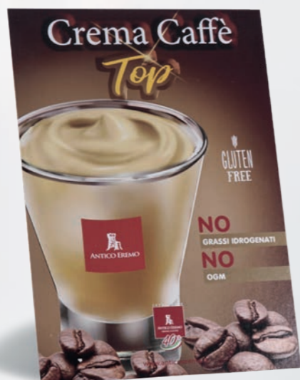
display 21x30 cm • cod. 90170