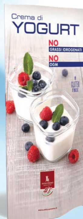
two-sided totem 45x120 cm • cod. 90177