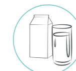
water or milk