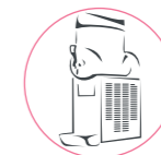
new generations slush machine