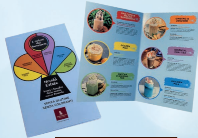
table menu 10,5x30 • cod. 09972 ANT