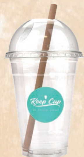
take-away cup 400 cc • cod. 099991