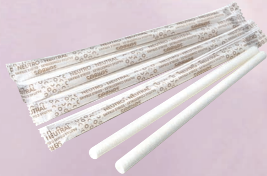
sugar straws cod. 90190