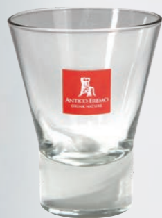
glass 15 cl. • cod. 09984 ANT