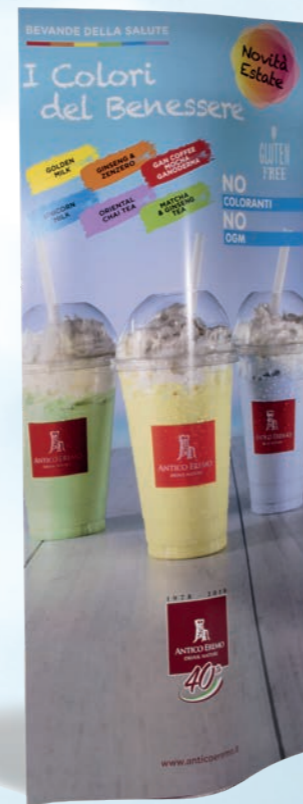
two-sided totem 45x120 cm - cod. 90182