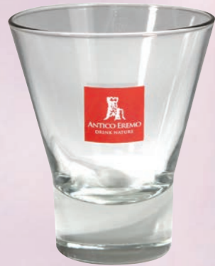
glass 25 cl. • cod. 09984