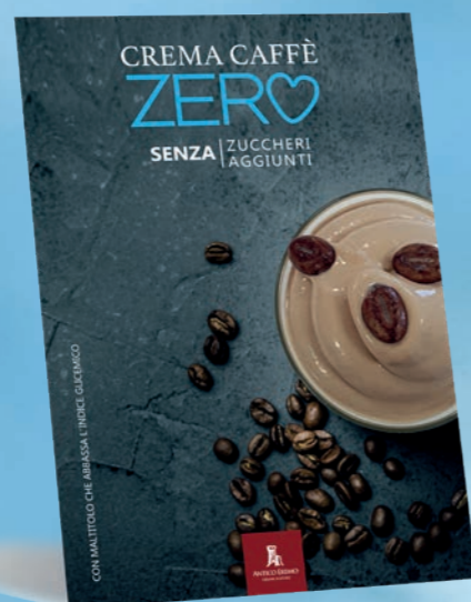
display 21x30 cm • cod. 90192