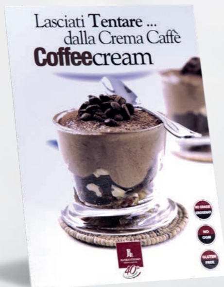
display 21x30 cm • cod. 90089