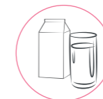
water or milk