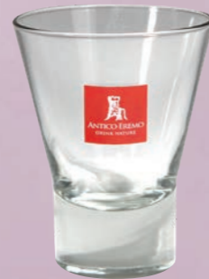
glass 15 cl. • cod. 09984 ANT