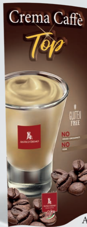
two-sided totem 45x120 cm • cod. 90173