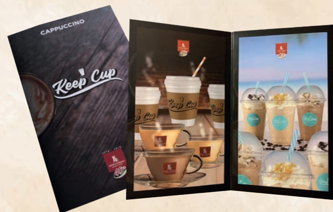
table menu 10,5x30 • cod. 09990 ANT