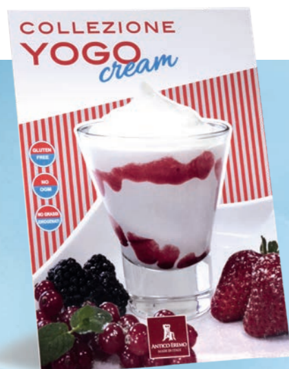
display 21x30 cm • cod. 90081