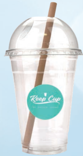
Take-away cup 400 cc • cod. 099991