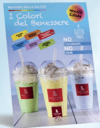
display 21x30 cm - cod. 90172