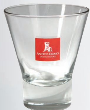
bicchiere di vetro 25 cl. • cod. 09984