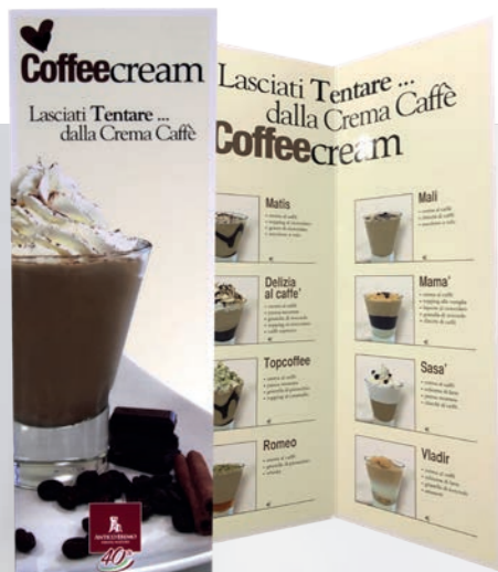
table menu 21x30 cm • cod. 09976 ANT