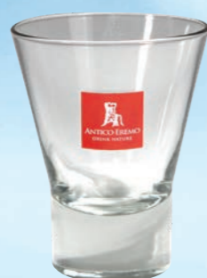
glass 15 cl. • cod. 09984 ANT