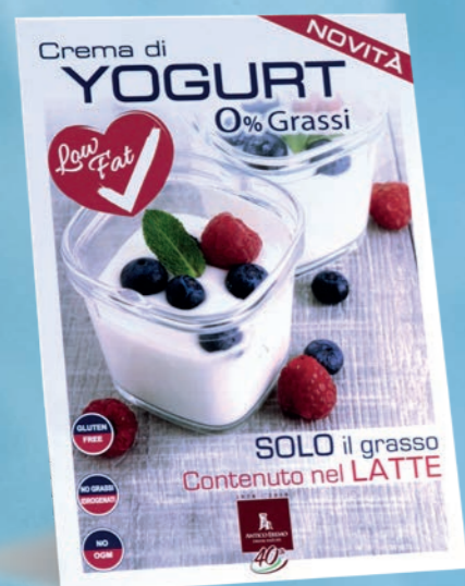
display 21x30 cm • cod. 90166