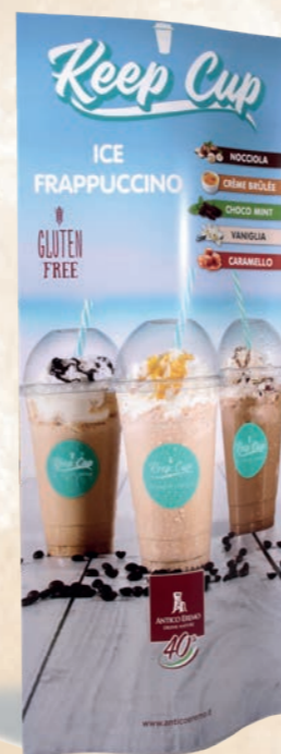
two-sided totem 45x120 cm - cod. 90182