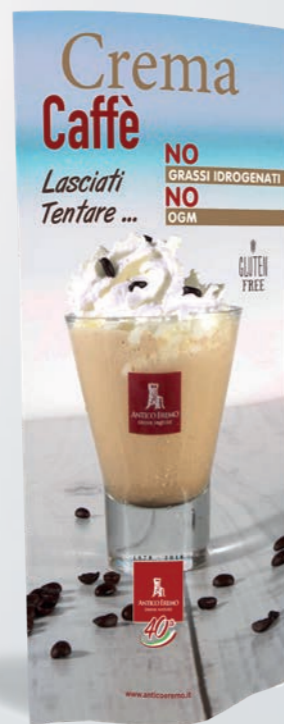
two-sided totem 45x120 cm • cod. 90175