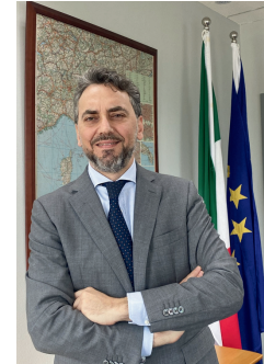
GIORGIO CALVERI Trade Commissioner for Singapore and the Philippines