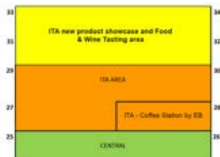
Italian Pavilion Floor Plan (THAIPEX-ANUGA ASIA 2022)