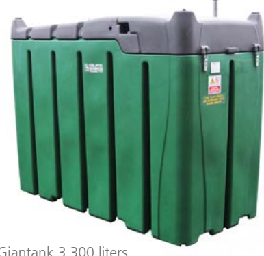
Giantank 3.300 liters