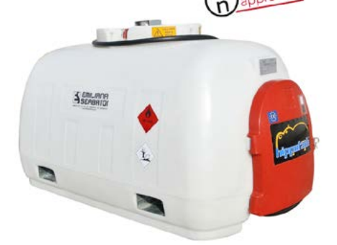
Hippotank 960 liters

Servicing areas as divers as construction, agriculture, oil and gas sectors, military and governmental sectors, transport field, disaster relief and client rapid response needs, over the last 38 years Emiliana Serbatoi has gained a reputation as the leader in the Design, Production, Supply of fueling systems to clients and customers in both the European and Global Markets