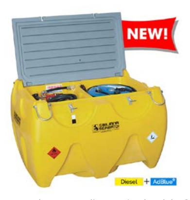
Carrytank 900+100 liters - Diesel+AdBlue®