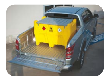
Carrytank Pick-up 440 liters

Emiliana Serbatoi is a 38-years-old company located in Modena, Italy. The firm is a leading producer of equipment, devices and systems for storage, transport and delivery of petroleum products and liquids in general since its founding.