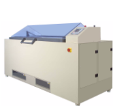
Corrosionbox H 600 I