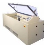
Corrosionbox H 1000 I