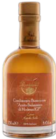
White Condiment with Balsamic Vinegar of Modena Density 1.21

This delicate dressing is obtained by mixing grape must, wine vinegar and Balsamic Vinegar of Modena. e light and transparent color make it prefer to preserve the original color of the dish while giving a special and bittersweet note to the whole.