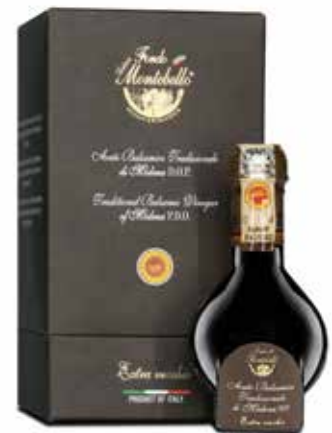
EXTRA VECCHIO - 25 Years