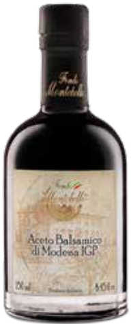
Balsamic Vinegar of Modena AS - Density 1.21

This delicate dressing is obtained by mixing fresh apple juice with naturally acetified apple cider. The blend is then aged in French oak barrels. The result is an Apple Dressing characterized by a light acidity and a pleasant bouquet of fruity notes and vanilla to be enjoyed with salads, second courses or desserts.