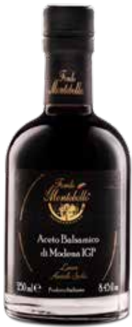
Balsamic Vinegar of Modena AS 04 Density 1.31

Characterized by a rich scent and round acidity balsamic, capable of enhancing with its intensity the flavor of the dishes given by the woody notes. In addition to being used for embellish vegetables, salad of all kinds.