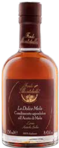
Apple Cider Vinegar with Balsamic Vinegar of Modena Density 1.21

This delicate dressing is obtained by mixing grape must, wine vinegar and Balsamic Vinegar of Modena. e light and transparent color make it prefer to preserve the original color of the dish while giving a special and bittersweet note to the whole.