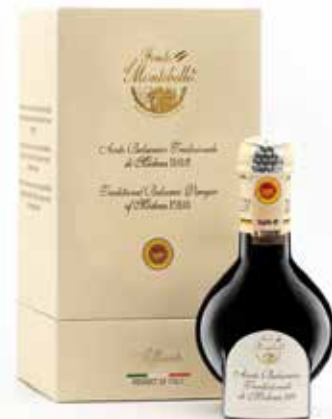
AFFINATO - 12 Years

Each bottle features a seal of guarantee bearing two codes. The Consortium keeps a bottle from each batch bottled since 1979 to guarantee the traceability of the product. Each batch that the producer wants to market must pass the organoleptic test carried out by expert tasters. Furthermore, European Community legislation now guarantees the entire production chain's compliance with the regulations for the use of the Protected Designation of Origin label. The Balsamic Vinegar “Tradizionale di Modena DOP” owes its flavour tanks to the cooking of musts obtained from a typical grape variety grown in Modena countryside and the climate characteristics which make possible an unique and particular processes that during aging gift the product of an intense and unmistakable aroma. Its particular characteristic in exalting the perfumes and flavours of the dishes in which it is added, makes the Balsamic Vinegar “Tradizionale di Modena DOP” one of the most appreciated products of the traditional Emilian cuisine. Preferably used raw, is best when savored along with Parmesan cheese or other cheeses, on pasta, pizza and fish. Also blends wonderfully with roast and boiled meats, grilled vegetables and, with a few drops will enhance the flavor of fruit, cake and ice cream.