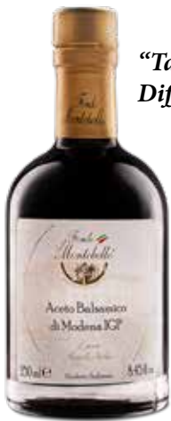
Balsamic Vinegar of Modena AS 02 Density 1.34

Of deep color, bright, dark brown has a high density. With a strong and sweet and sour taste, with notes of plum, black cherries and sweet spices. During the ageing process each wood leaves to a particular feature. Chestnut, rich in tannins, contributes to the dark color, oak gives a typical vanilla perfume, Cherry sweetens the taste. It is recommended for cooking meats, boiled or grilled, legumes and fresh dressing for various savory dishes.