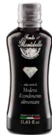
DIAMOND Densità 1.35

Our Condiments with Balsamic Vinegar of Modena PGI are obtained by blending Balsamic Vinegar of Modena with Cooked Must. The slow acetic fermentation makes it so aromatic and colorful to make it look like with Traditional Balsamic Vinegar of Modena. For this it is not necessary to add any type of preservative or colorants. It is the result of a small production of very high quality. It is suitable for use in special circumstances, has an intense aroma, a markedly sweet and sour balanced round taste and a high density.