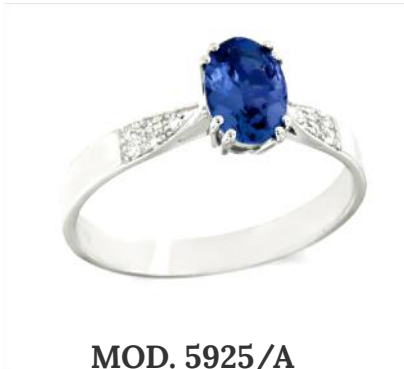
MOD. 5925/A Gold gr. 2.30 Diam. ct. 0.6 Tanz. ct. 0.96 € 360,00*