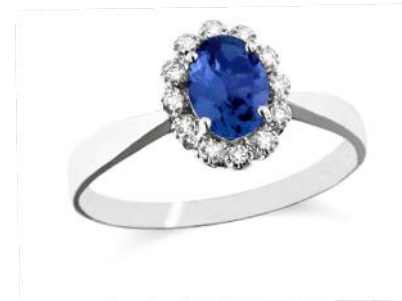
MOD. 5475/A Gold gr. 1.80 Diam. ct. 0.12 Tanz. 1.00 € 370,00*