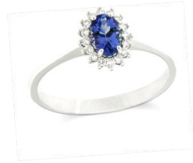
MOD. 5914/A2 Gold gr. 2.00 Diam. ct. 0.12 Tanz. ct. 0.62 € 340,00*