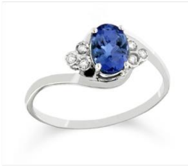
MOD. 5929/A Gold gr. 1.90 Diam. ct. 0.07 Tanz. 0.96 € 335,00*