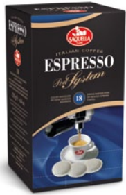
code 00667 REGULAR ESPRESSO COFFEE POD Box of 18 pods x 6,7g