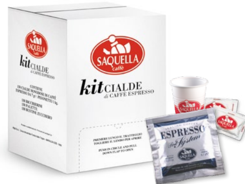
code 00659 KIT ESPRESSO COFFEE POD Case of 150 pods x 6,7g + KIT consists of: 150 espresso plastic cups 150 single portion sugar sachets 150 plastic sticks