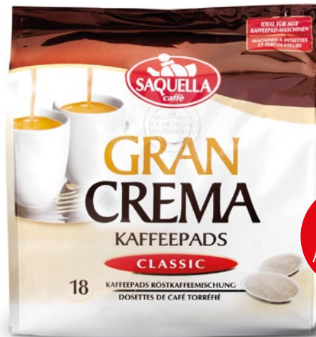
GRAN CREMA CLASSIC code 18002. 18 pods - Bag Net Wt. 130g