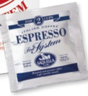
code 00622 REGULAR ESPRESSO COFFEE DOUBLE POD Case of 100 pods x 14g