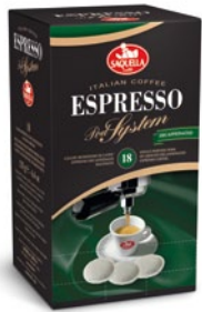
code 00678 DECAFFEINATED ESPRESSO COFFEE POD Box of 18 pods x 6,7g