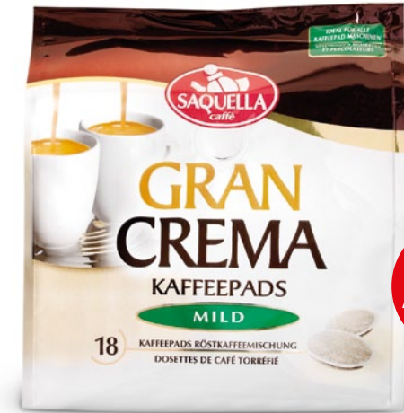
GRAN CREMA MILD code 18001. 18 pods - Bag Net Wt. 130g