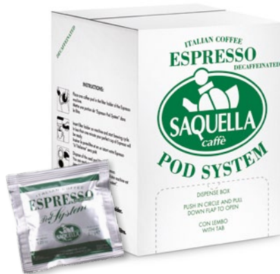
code 00653 DECAFFEINATED ESPRESSO COFFEE POD Case of 150 pods x 6,7g