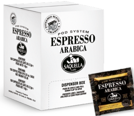
code 00654 100% ARABICA COFFEE POD Case of 150 pods x 6,7g