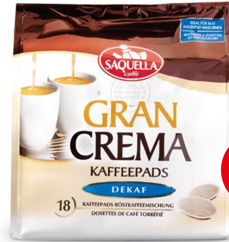
GRAN CREMA DEKAF code 18003. 18 pods - Bag Net Wt. 130g