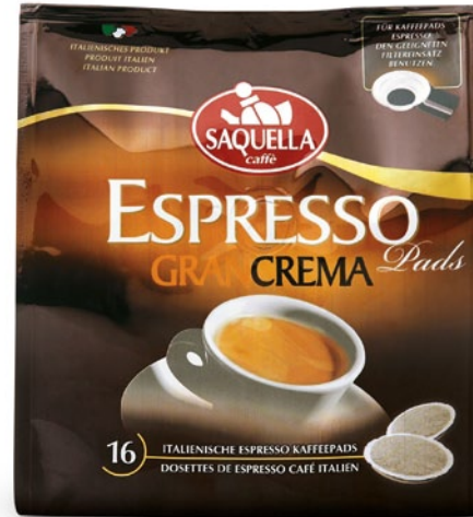
ESPRESSO GRAN CREMA code 00680. 16 pods - Bag Net Wt. 111g