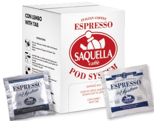
code 00652 REGULAR ESPRESSO COFFEE POD Case of 150 pods x 6,7g