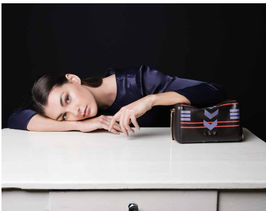
squeeze small signal