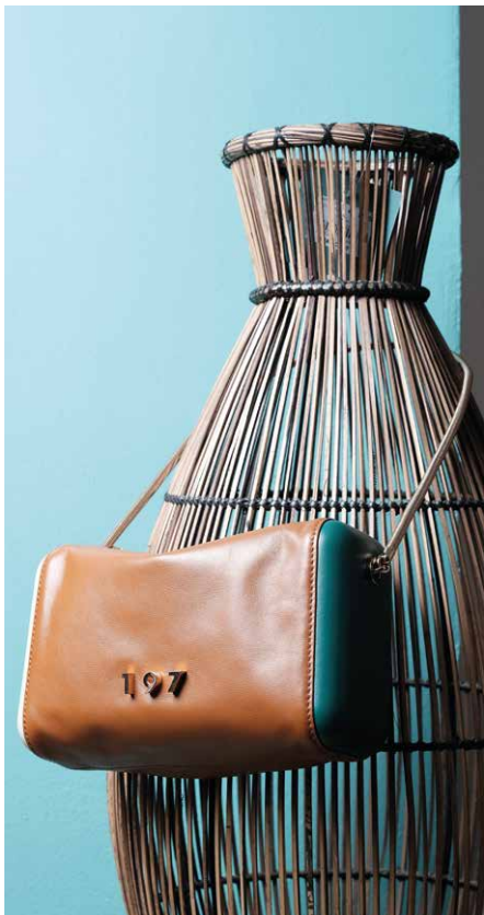
squeeze small tricolor