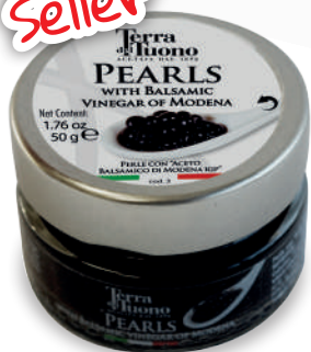
Pearls with Balsamic Vinegar of Modena