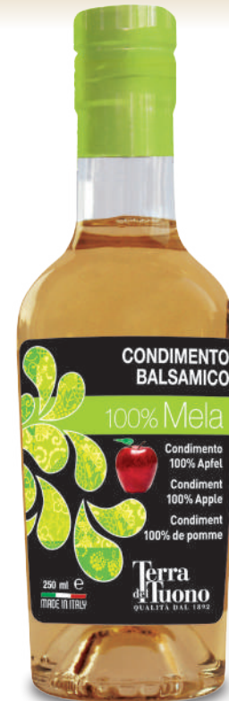
100% Apple Balsamic Condiment 100% Apple density approx. 1,22