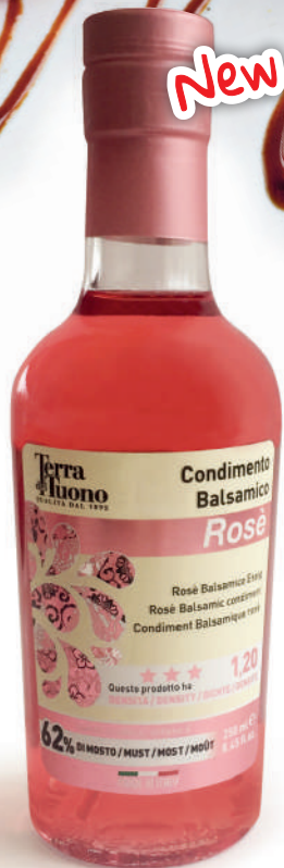
Rosé Balsamic density approx. 1,20