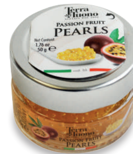
Passion fruit Pearls