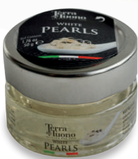
White Balsamic Pearls