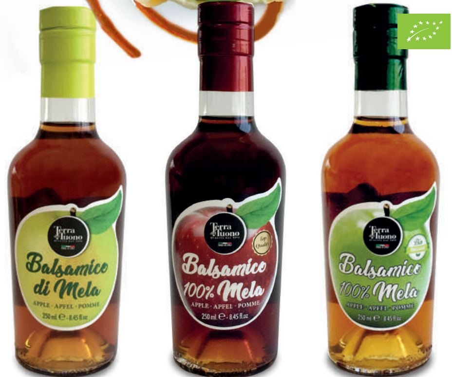
Apple Balsamic Condiment Yellow version