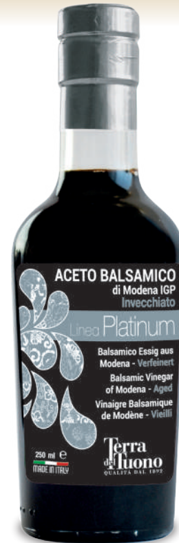
Linea Platinum - Aged Balsamic Vinegar of Modena density approx. 1,35