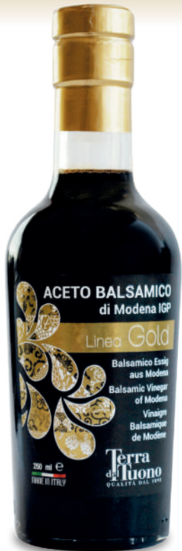
Linea Gold Balsamic Vinegar of Modena density approx. 1,30