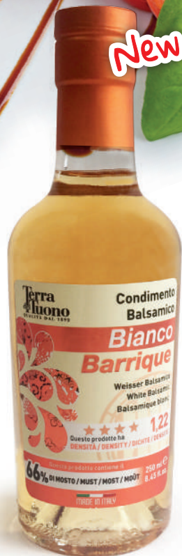
White Balsamic - Barrique density approx. 1,22