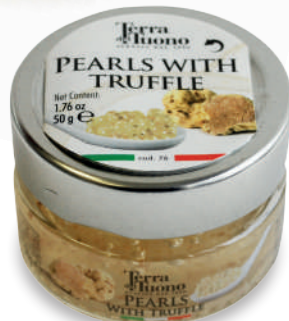
Pearls with Truffle