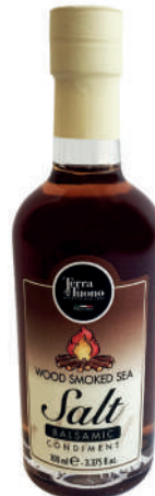
Wood smoked sea Salt Balsamic