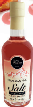
Himalayan Pink Salt Balsamic