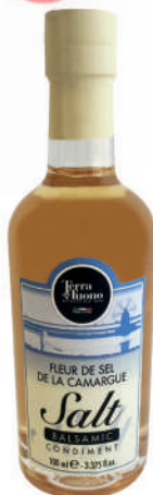
Fleur de sel de la Camargue Salt Balsamic