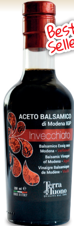
Aged Balsamic Vinegar of Modena density approx. 1,34