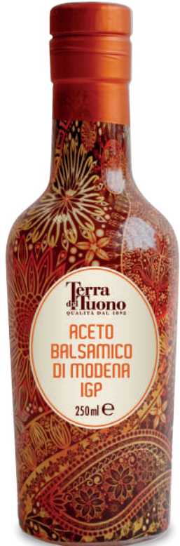
Balsamic Vinegar of Modena