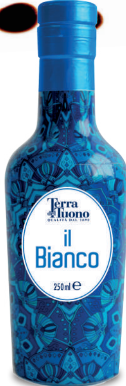
The White Balsamic