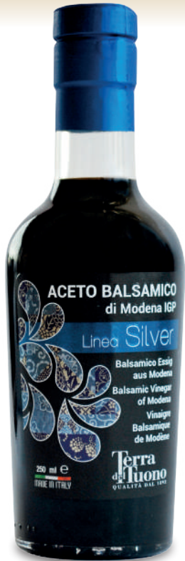
Linea Silver Balsamic Vinegar of Modena density approx. 1,25