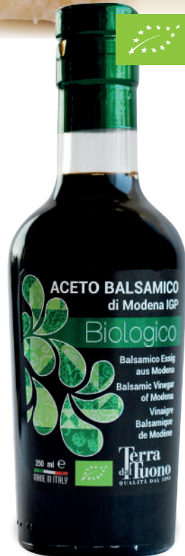
Organic Balsamic Vinegar of Modena density approx. 1,30