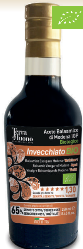
Organic Balsamic Vinegar of Modena Aged - density approx. 1,30