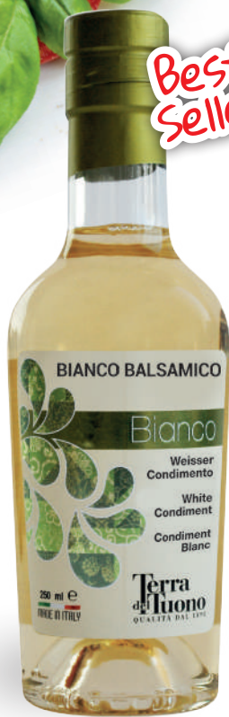
The White Balsamic Condiment from white grapes density approx. 1,20