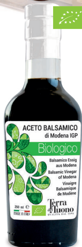
Organic Balsamic Vinegar of Modena density approx. 1,20