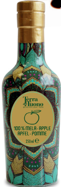
100% Apple Balsamic