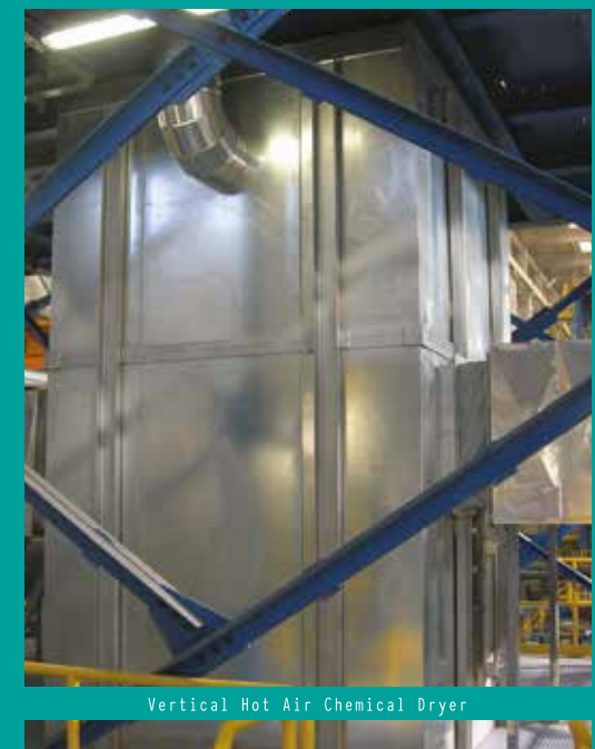
Vertical Hot Air Chemical Dryer