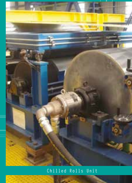
Chilled Rolls Unit

Vertical, Horizontal, Side shifting; manually controlled or fully automatic.