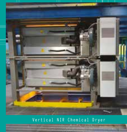
Vertical NIR Chemical Dryer