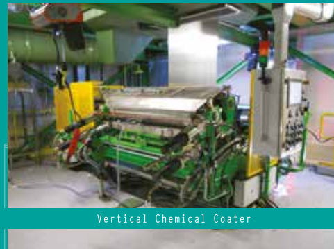
Vertical Chemical Coater