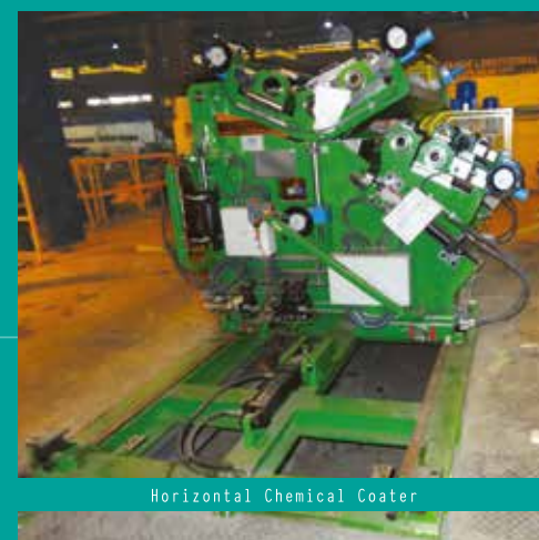
Horizontal Chemical Coater

Whether you need to apply passivation, anti finger print or corrosion resistant products for any subsequent application (from automotive to organic painting), you will need equipment that fits into the available space (in retrofits), allows a continuous operation (even when you need to change product), guarantees uniform and controlled coating thickness, minimum energy consumption.