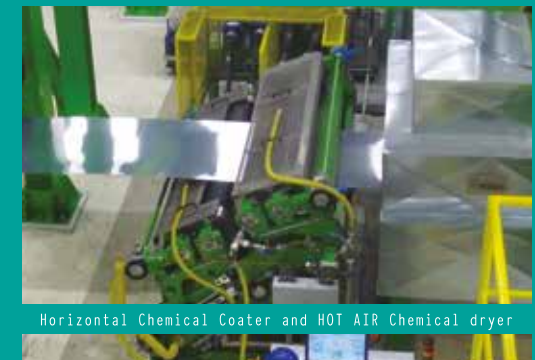
Horizontal Chemical Coater and HOT AIR Chemical dryer