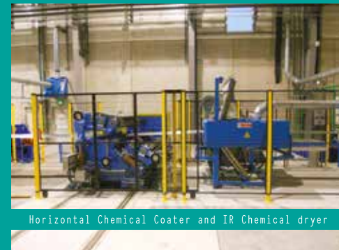
Horizontal Chemical Coater and IR Chemical dryer