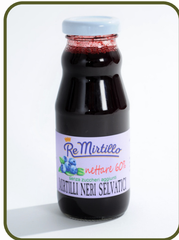
CODE : CF0019 Blueberries NO SUGAR ADDED juice ML200