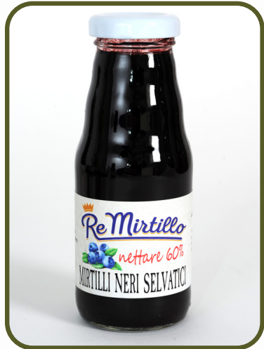
CODE : CF0016 Blueberries juice ML200