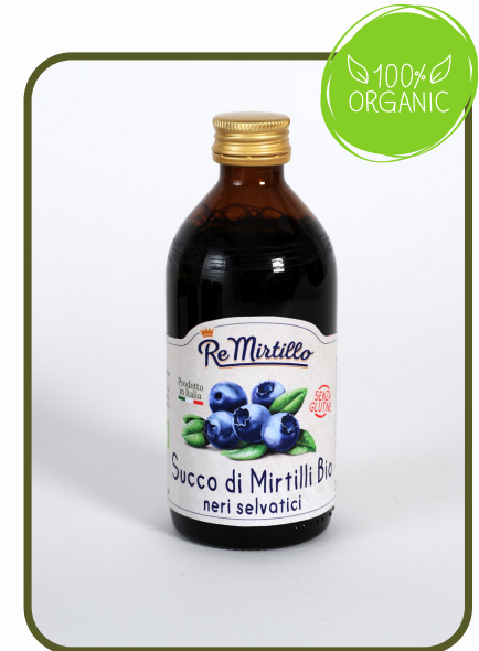
CODE : CF0015 Organic 100% blueberries juice ML200