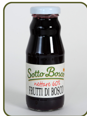
CODE : CF0018 Mix fruits juice ML200