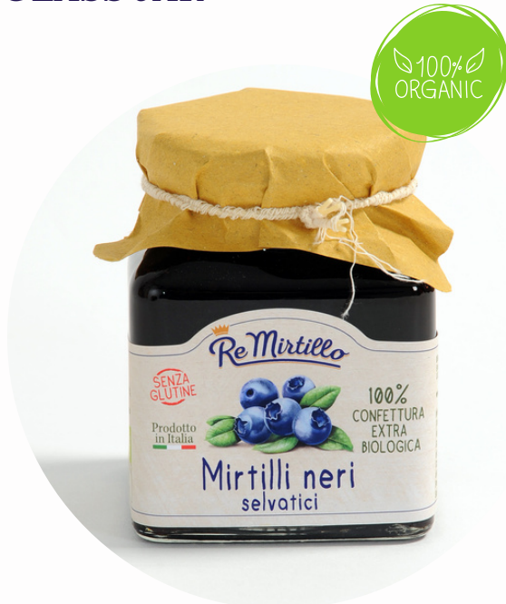
CODE : CF0001 Extra jam Wild blueberries Gr.340