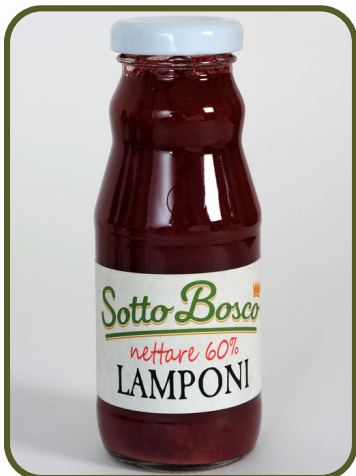
CODE : CF0017 Raspberries juice ML200