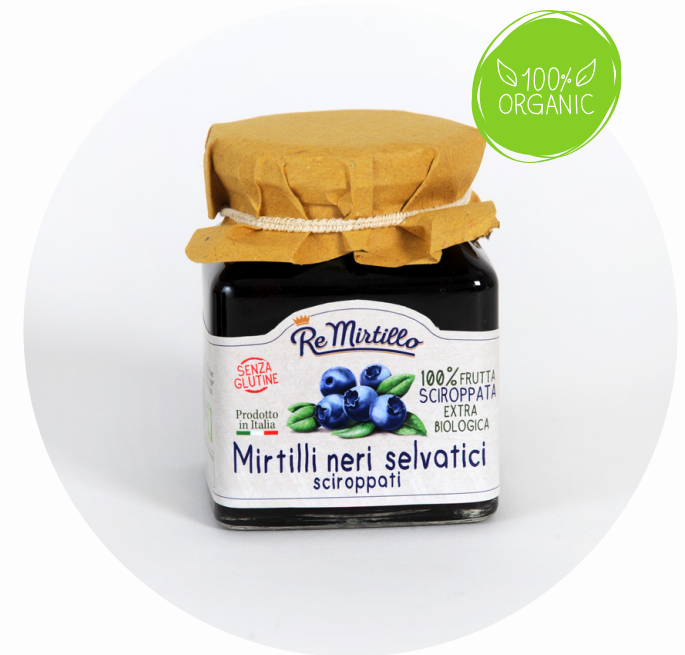
CODE : CF0010 Natural wild blueberries in syrup Gr.340