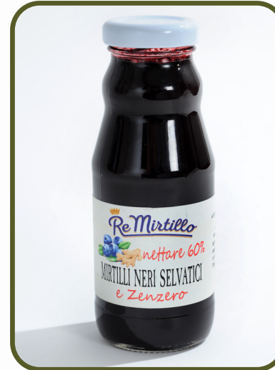
CODE : CF0020 Blueberries+ginger juice ML200