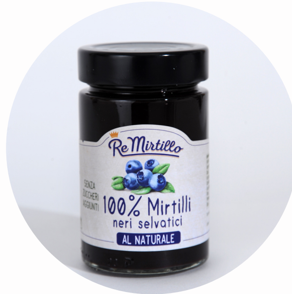
CODE : CF0005 100% Natural wild blueberries Gr.200