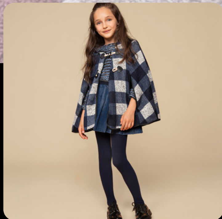
Girl natural fiber tights