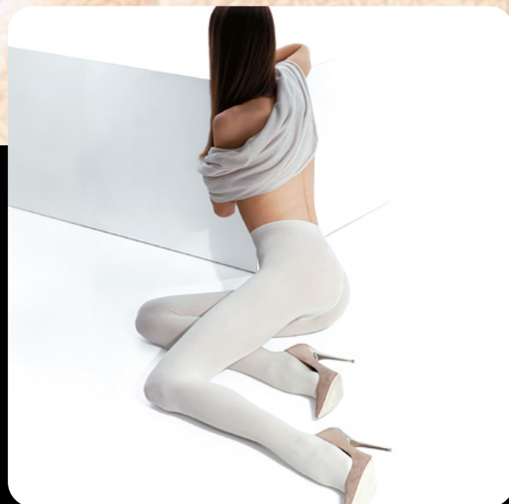
Woman natural fiber tights