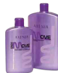
ONDEMOVE waiving system