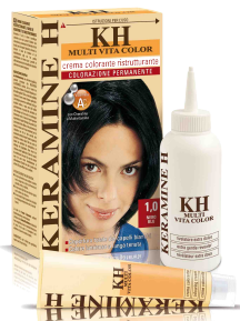
RESTRUCTURING COLOURING CREAM do-it-yourself & COLOR REMOVER