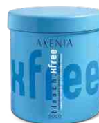
XFREE Ammonia free deco powder