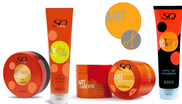
ART - Gelly & Paste Matt Resculpting gel, Firm hold gel, Wetwood Wax