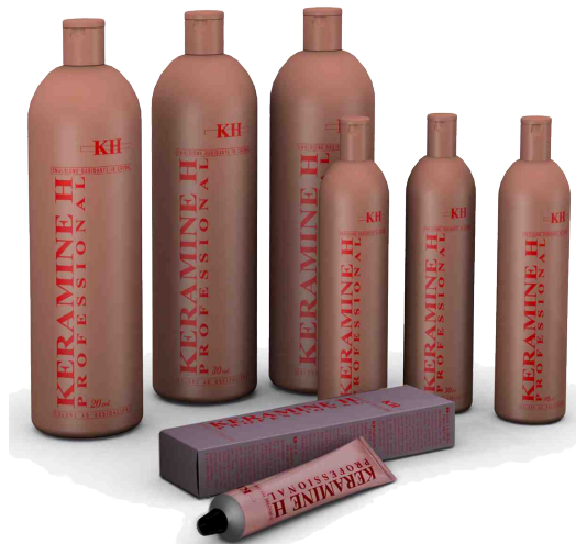
OXIDATION HAIR COLOR CREAM