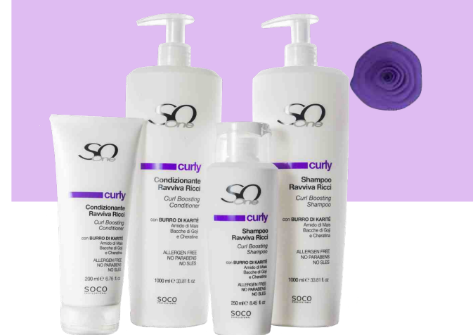
CURLY - Curl Boosting For curly and frizzy hair