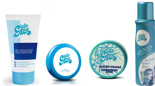
GEL, WAX, GELACCA