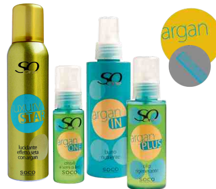
ARGAN - Crystals with flax seeds, Nourishing butter, Regenerating oil, Silk effect polish