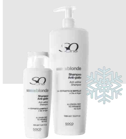
BLONDE - Anti-yellow For blond and grey hair