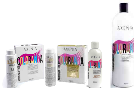
COLORANDA Ammonia Free color fluid