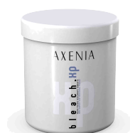
XP Compact powder