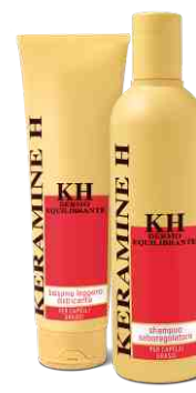
SKIN BALANCING LINE