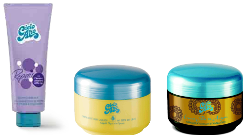
MASKS & CREAMS