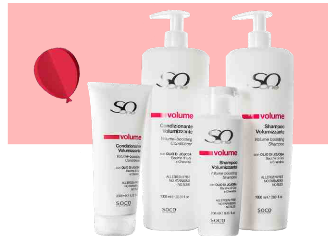
VOLUME - Volume boosting For fine, lifeless hair