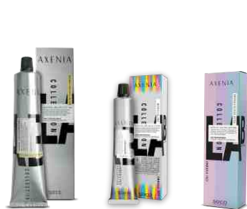
LAB COLLECTION Oxidation hair color cream