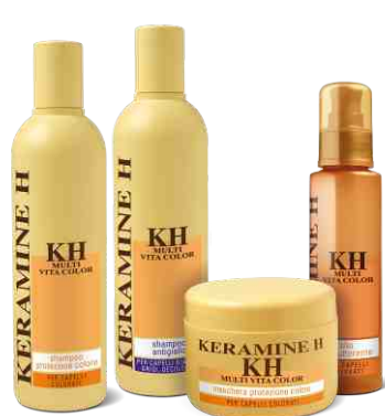
MULTI VITA COLOR LINE