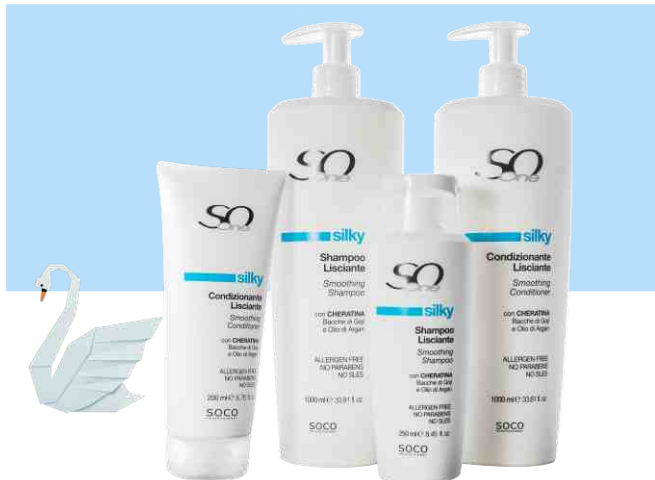
SILKY - Smoothing For unmanageable hair