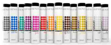
SMART.PLEX Direct color + treatment