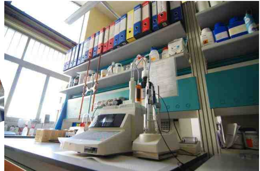
The manufacturing plant