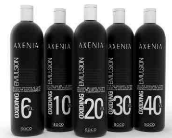
OXIDING EMULSION 6, 10, 20, 30, 40 volumes