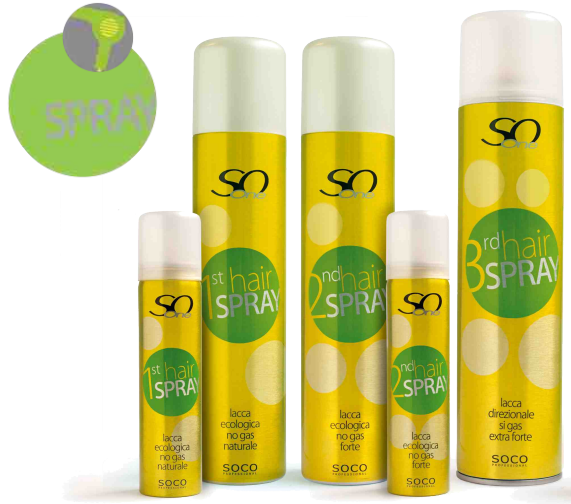
SPRAY - ECOLOGICAL HAIRSPRAYS No Gas Natural & Strong Hold, with gas