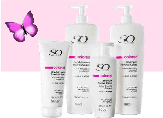
COLORED - Colour Boosting For coloured, sensitised hair