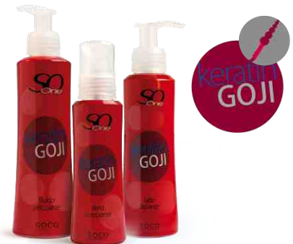
KERATIN GOJI - Thickening serum, Curling fluid, Straightening milk