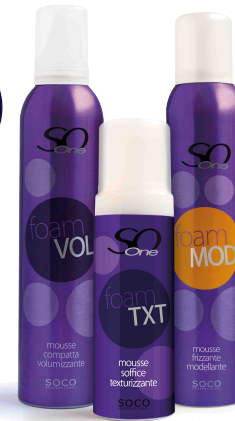
FOAM - MOUSSE for Volume, for Texture, for Modeling