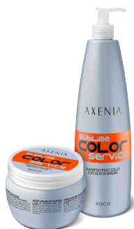
SUBLIME COLOR SERVICE Post color