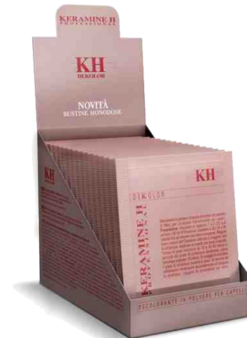
DEKOLOR – Compact bleaching powder in monodoses