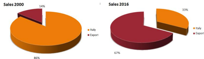
FROM ITALY TO THE WORLD