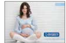
Guide for operators