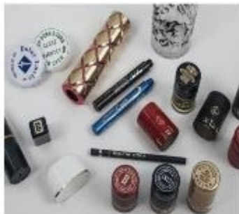
Caps and bottles