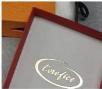
Boxes & Cases