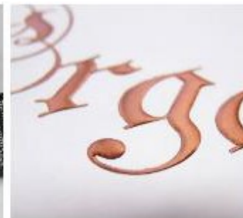
Bags and shoppers