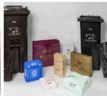
Crates & Cases