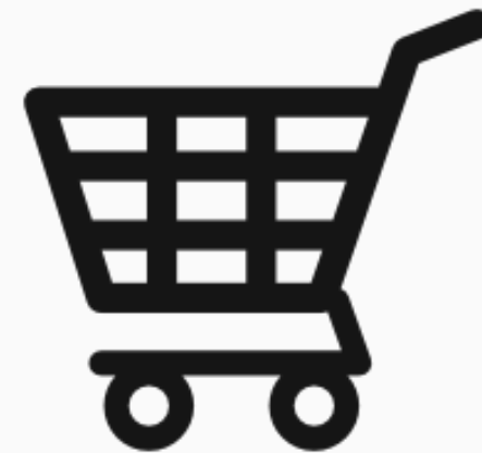
Retails and E-commerces