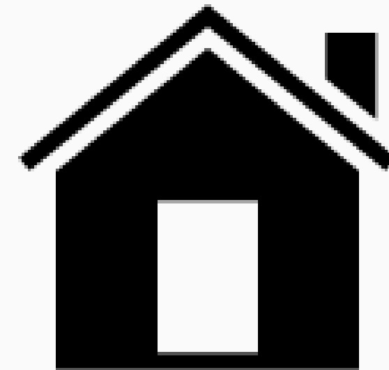
Houses and Offices

OUR CUSTOMERS HELP TO STRENGTHEN AS INTERPRETER AND AMBASSADOR OF OUR VALUES AND OF THE EXPERIENCE THAT YOU LIVE DRINKING A SARDELLA COFFEE