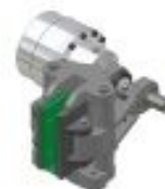
Negative hydraulic caliper model SPR-N4Y