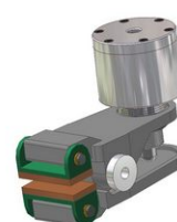
Positive Pneumatic Collet model SPO-05

The negative brakes allow to satisfy the need to brake and block the rotating parts of the machines without any external energy source. In this typology of product the braking force is guaranteed by the springs present inside the brake, and it is therefore an application of remarkable interest.