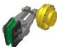
Negative pneumatic caliper model SPL-N3

The negative brakes allow to satisfy the need to brake and block the rotating parts of the machines without any external energy source. In this typology of product the braking force is guaranteed by the springs present inside the brake, and it is therefore an application of remarkable interest.