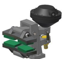
Positive Pneumatic Collet model SPF-3

The wide range of pneumatically actuated caliper brakes makes it possible to meet the most diverse requirements in the field of modern machine design. The wide range of mounting possibilities together with the effectiveness and precision of the pneumatic device allow to solve any problem related to braking.