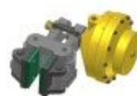
Negative pneumatic caliper model SPX-N3

The series of hydraulically controlled caliper brakes allows a wide range of solutions for braking problems, especially for those cases where the machine only allows hydraulic drives. The wide range of possible uses of this type of product make it its strong point.