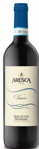
Dolcetto di Ovada DOC