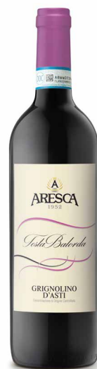
Grignolino d'Asti DOC "Testabalorda"