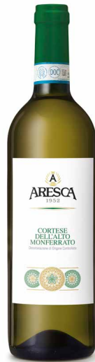
Cortese dell'Alto monferrato DOC