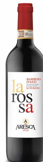
Barbera d'Asti DOCG Superiore "La Rossa"