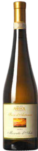
Moscato d'Asti DOCG "Fiore d'Autunno"