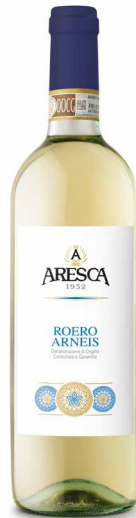
Roero Arneis DOCG