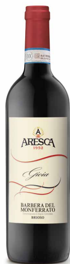
Barbera del monferrato DOC "Gioia"