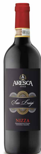
Nizza DOCG "San Luigi"