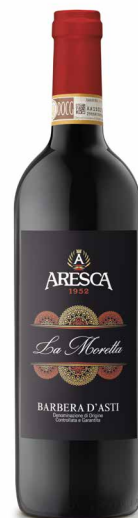
Barbera d'Asti DOCG Superiore "La Moretta"