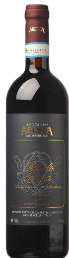
Nebbiolo d'Alba DOCG