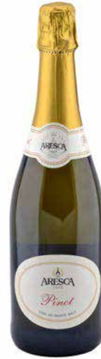
Pinot Spumante "Brut"