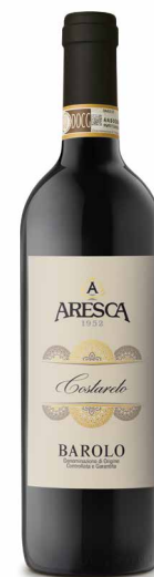
Barolo DOC "Costareto"