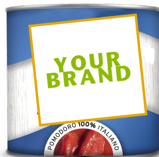
PEELED PLUM TOMATOES