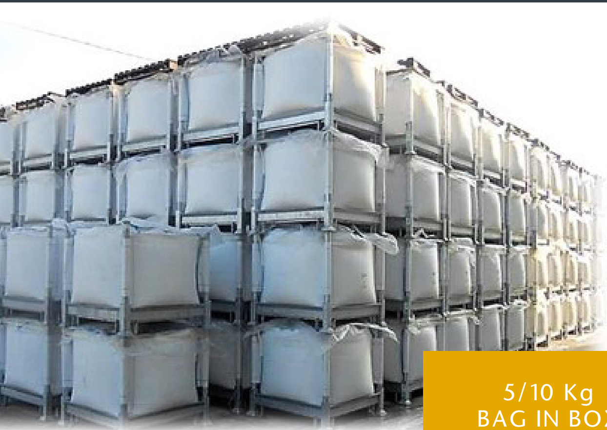
BIG BAG FOR INDUSTRIES