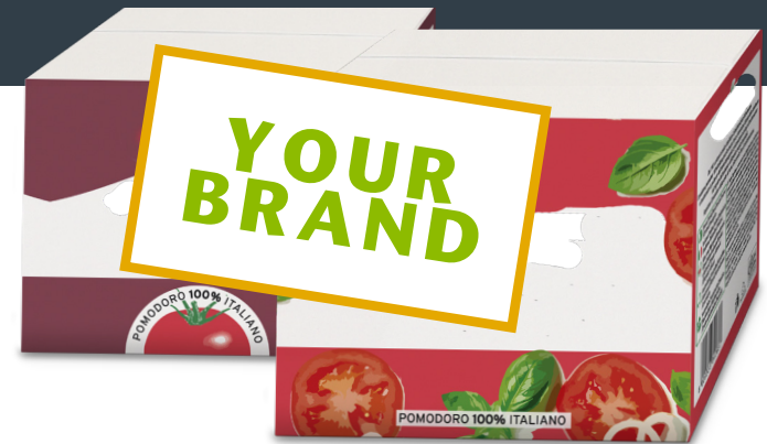
BAG IN BOX