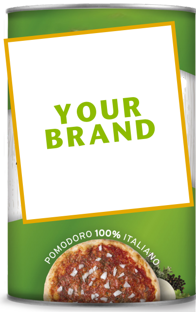
FLAVOURED PIZZA SAUCE