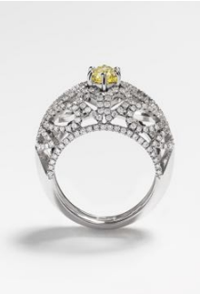
Ring in 18k white gold with 244 diamonds (1,20 G ct.) and a central fancy diamond (1,01 ct.) Art. GLC197