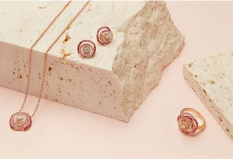
Ring in 18k rose gold with diamonds (0,30 ct.) and pink sapphires (0,76 ct.) Art. GLC111