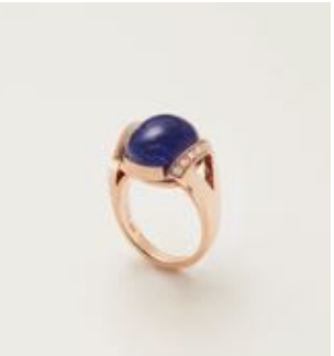
Ring in 18k rose gold with a central Tanzanite (16,46 ct.) contoured with diamonds (0,34 F ct.) Art. GLC155