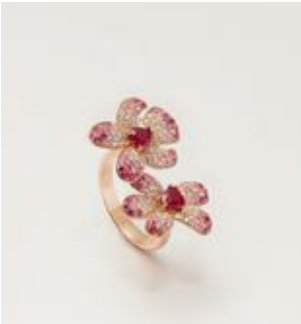
Ring in 18k rose gold with a pavé of pink sapphires, rubellites and rubies (1,07 ct.) Art. TMC101