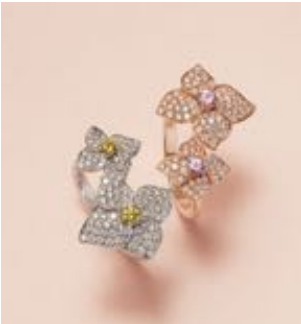
Double Flower Ring in 18k white gold with diamonds (0,77 G ct.) and two fancy diamonds (0,15 ct.) Art. GLP106