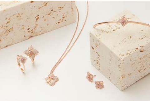
Ring Small in 18k rose gold with diamonds (0,22 F ct.) and pink sapphires (0,07 ct.) Art. GLP105