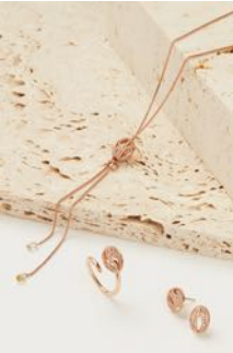
Necklace in 18k rose gold with 164 diamonds (0,82 G ct.) and two diamonds briolette (1,25 ct.) Art. GLL128