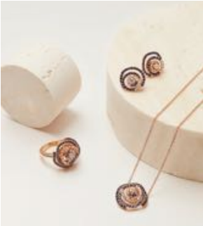
Necklace in 18k rose gold with diamonds (0,32 F ct.) and blue sapphires (0,82 ct.) Art. GLL106