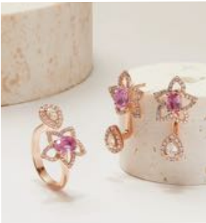
Ring in 18k rose gold with diamonds (0,26 ct.), a pink sapphire (1,05 ct.) and a drop diamond (0,23 ct.) Art. TMC102