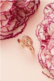
Ring in 18k rose gold with with 96 diamonds (0,38 G ct.) Art. TMP101