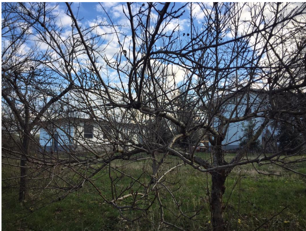
Laboratory, c/da Vertecchia-Pietradefusi (AV)