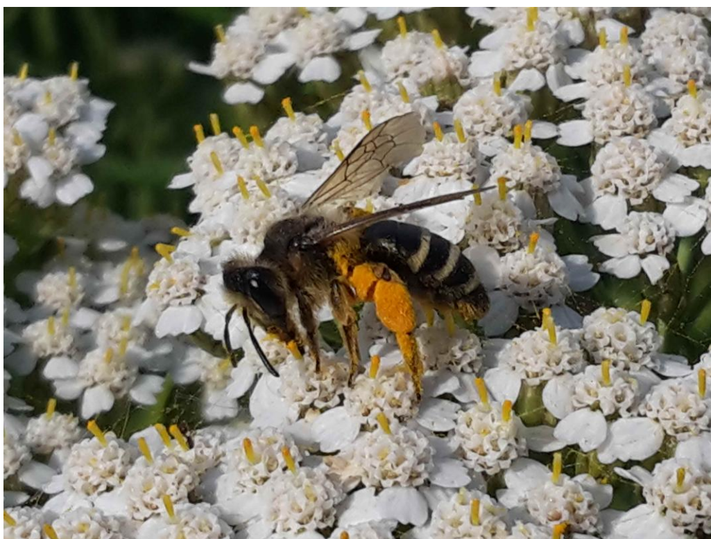
Achillea millefolium - detail