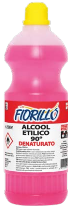
ETHYL ALCOHOL 90°