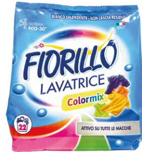
COLORMIX 22 WASHES