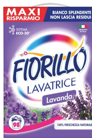
LAVENDER 98 WASHES