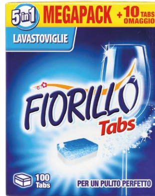
DISHWASHER TABS 100