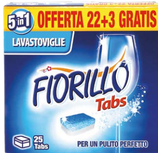
DISHWASHER TABS 25