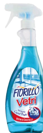
GLASS AND MIRRORS