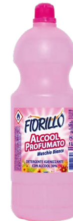
PERFUMED ETHYL ALCOHOL