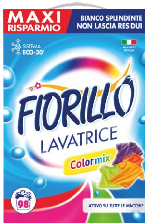
COLORMIX 98 WASHES