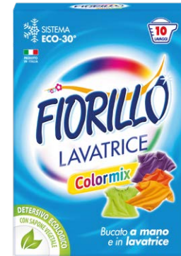
COLORMIX 10 WASHES