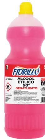
ETHYL ALCOHOL 90°