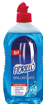
DISHWASHER RINSE AID