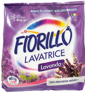
LAVENDER 22 WASHES